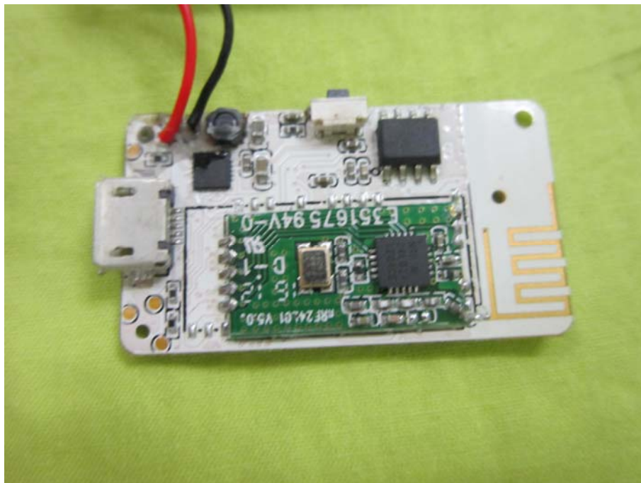
Front View of PCB