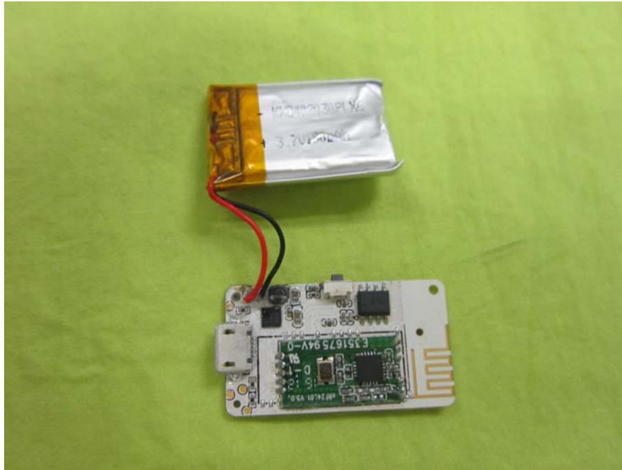
Internal View of EUT