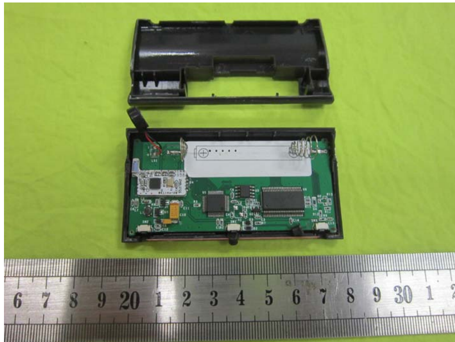
Internal View of EUT