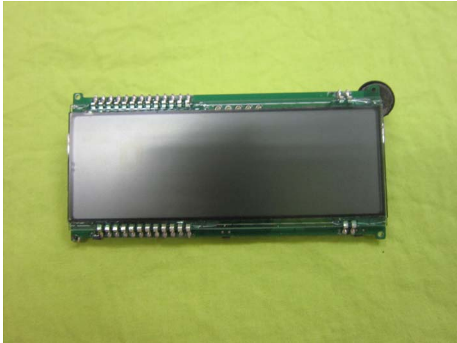
Rear View of PCB