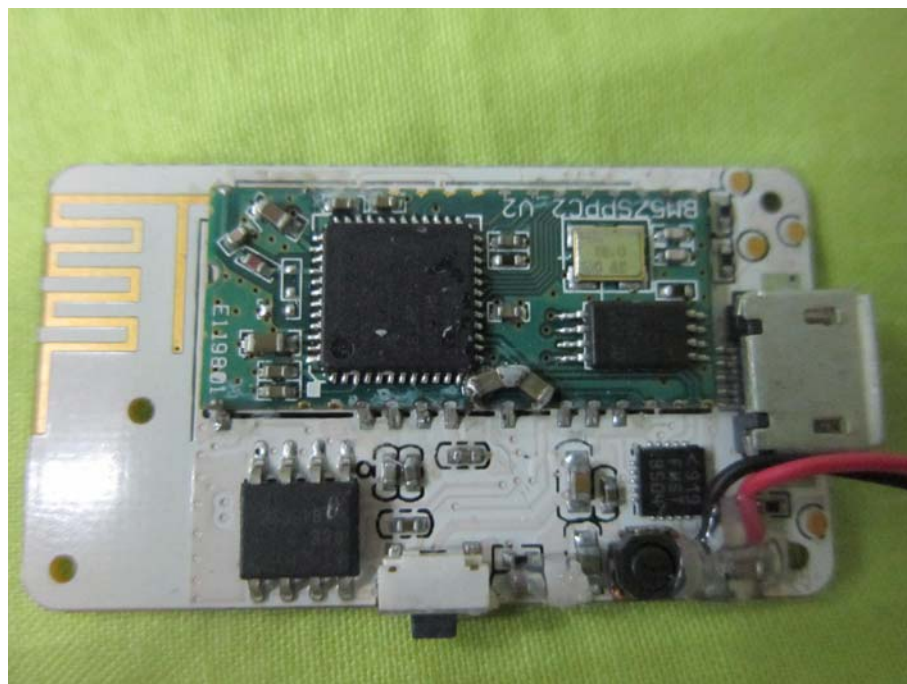
Front View of PCB