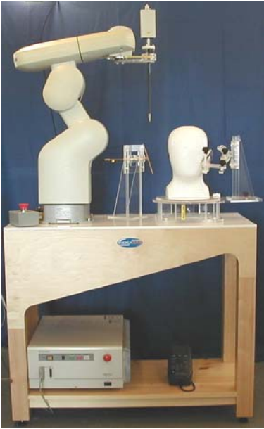
Figure 6: Principal components of the SAR measurement test bench

The major components of the test bench are shown in the picture above. A test set and dipole antenna control the handset via an air link and a low-mass phone holder can position the phone at either ear. Graduated scales are provided to set the phone in the 15 degree position. The upright phantom head holds approx. 7 litres of simulant liquid. The phantom is filled and emptied through a 45mm diameter penetration hole in the top of the head.