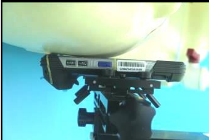
Head - Right Cheek