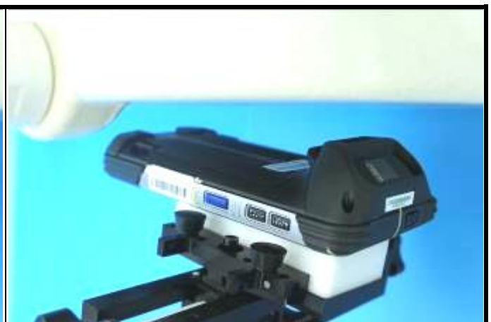
Body worn - Rear Face of EUT at 15 mm