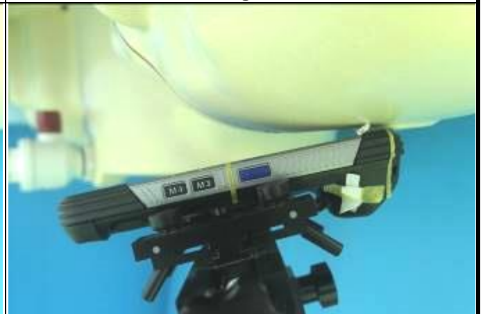
Head - Left Tilted