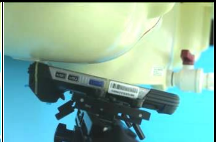
Head - Right Tilted