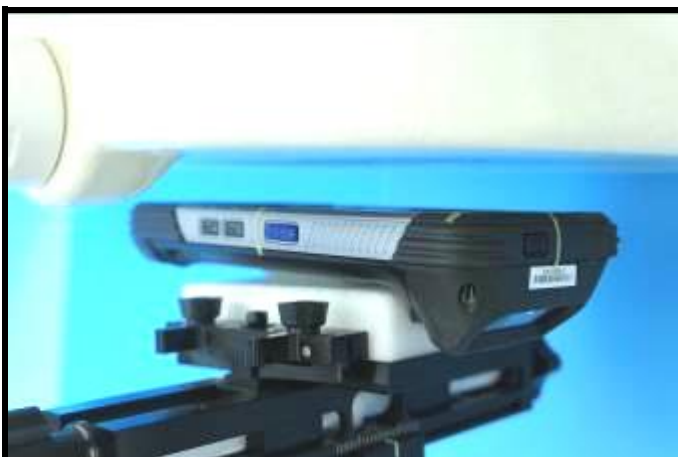
Body worn - Front Face of EUT at 15 mm