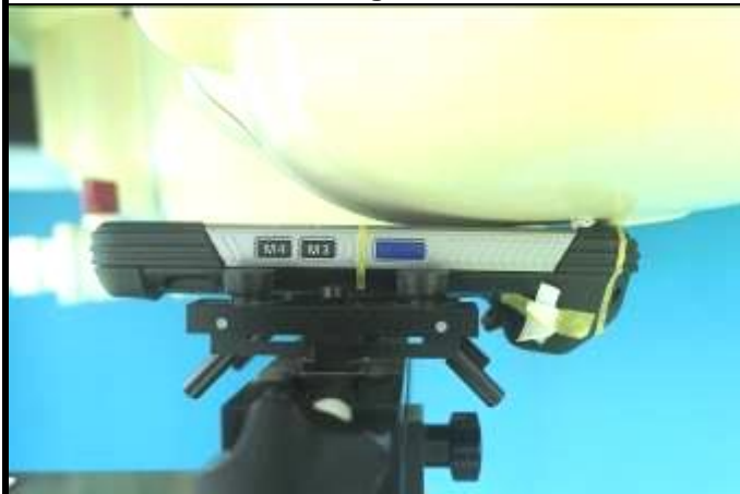
Head - Left Cheek