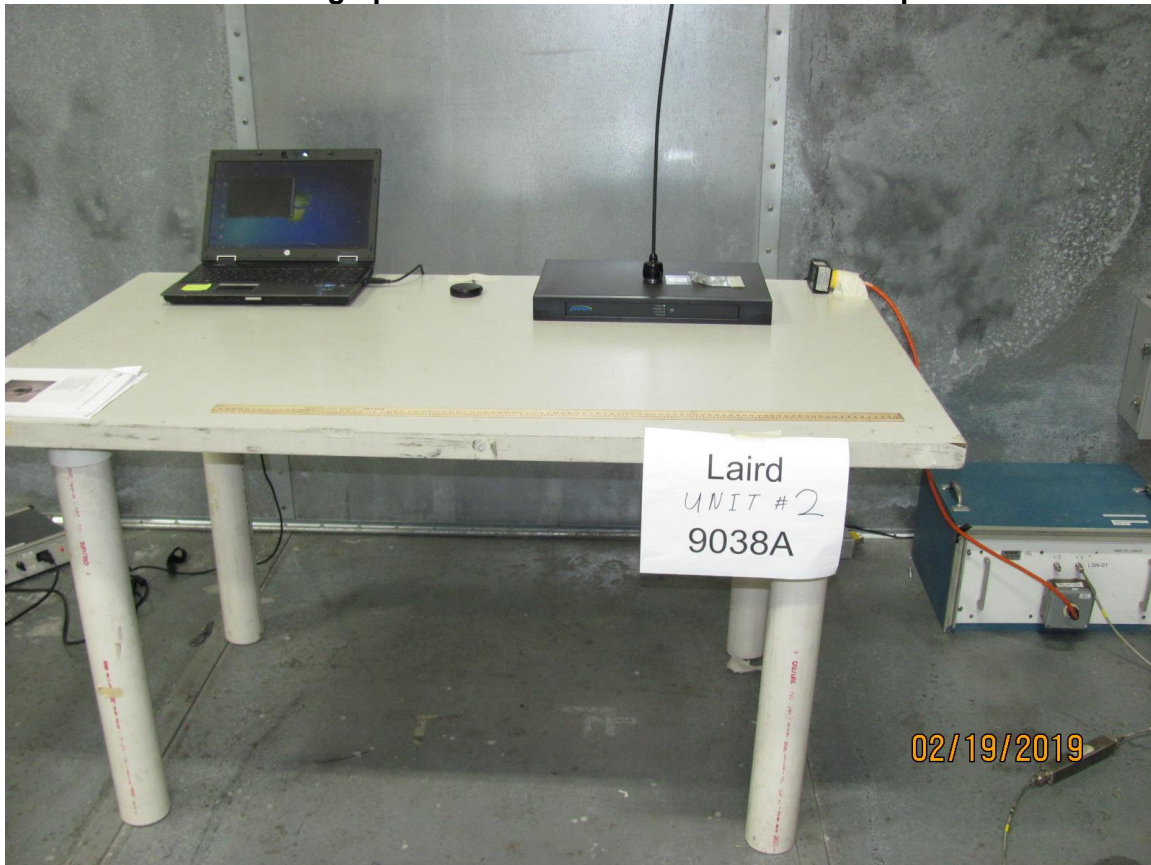
Photograph of Conducted Emissions Test Setup