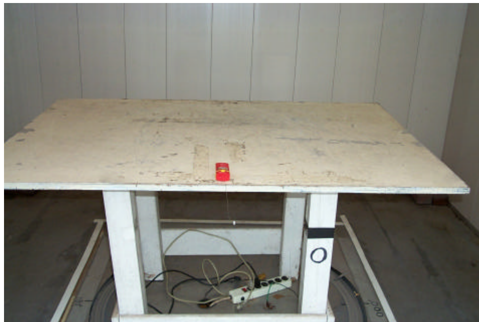
Figure 3.3 Radiated Test Setup, Position 3