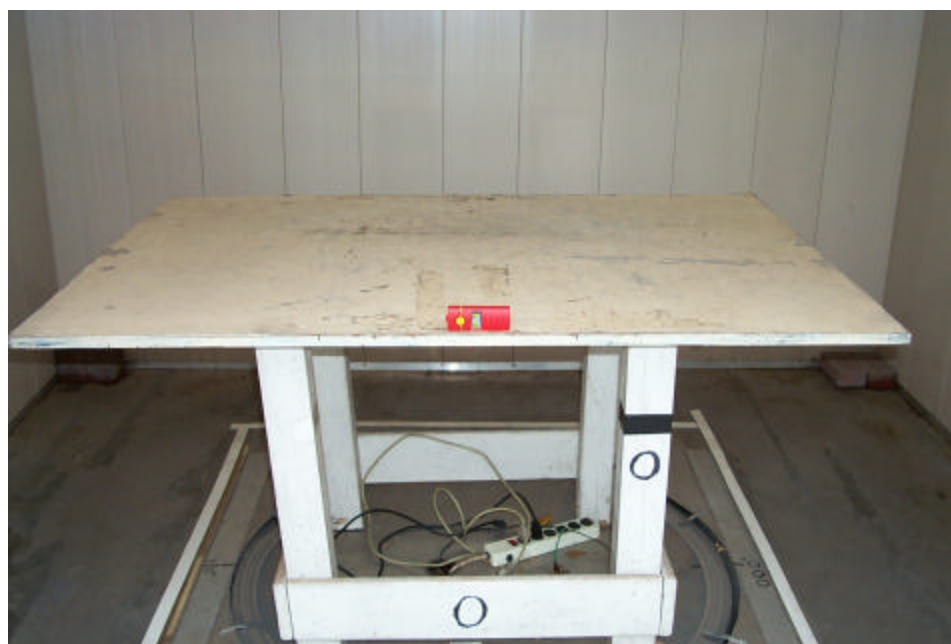
Figure 3.2 Radiated Test Setup, Position 2