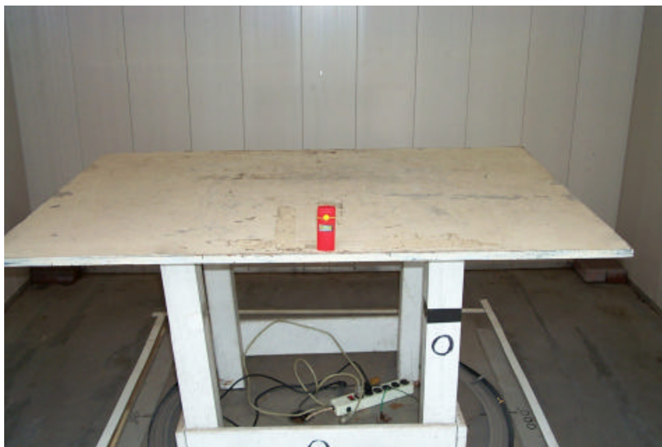
Figure 3.1 Radiated Test Setup, Position 1