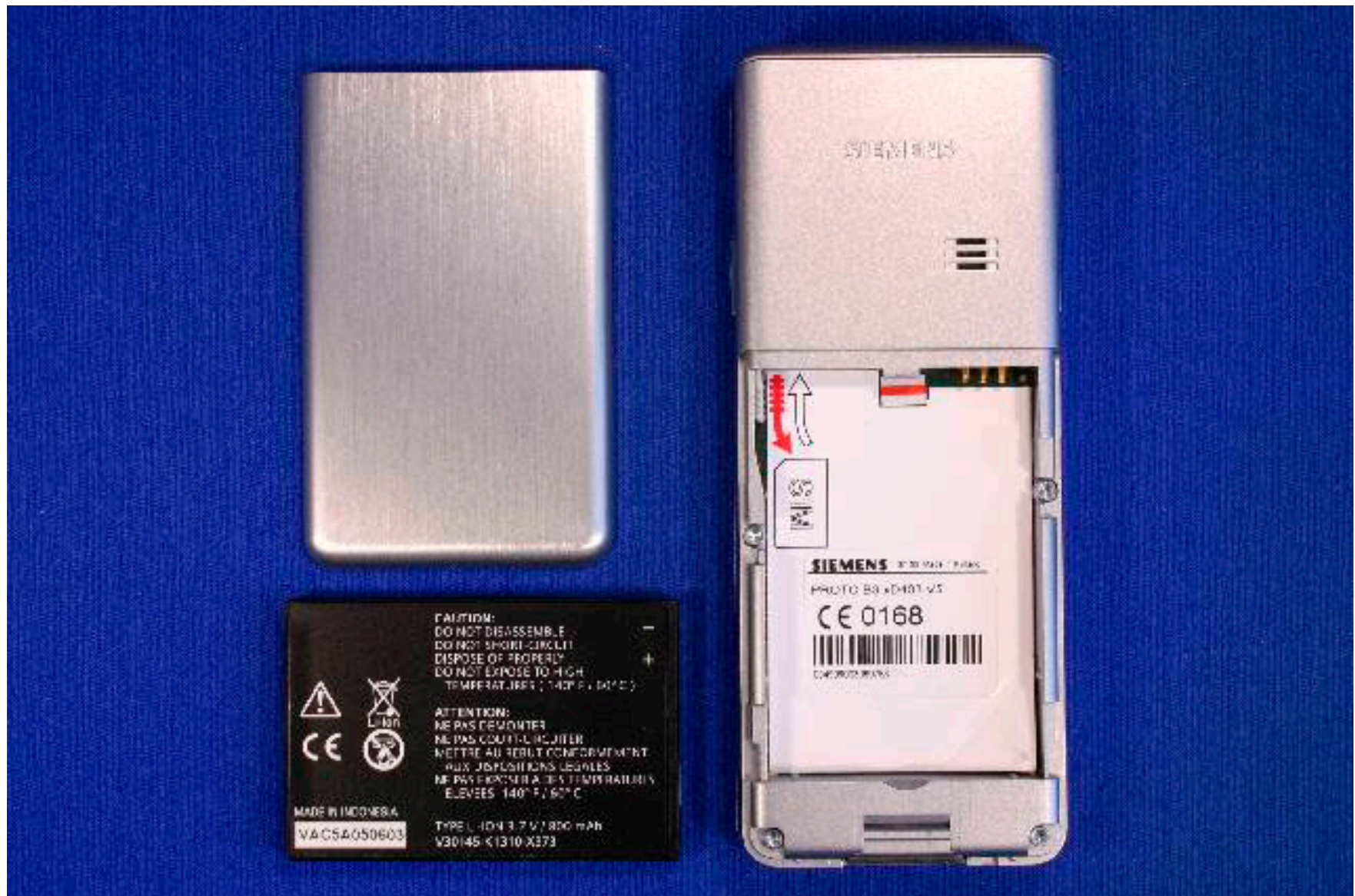
CC75 Open Battery Cover (Final label: See extra exhibit)