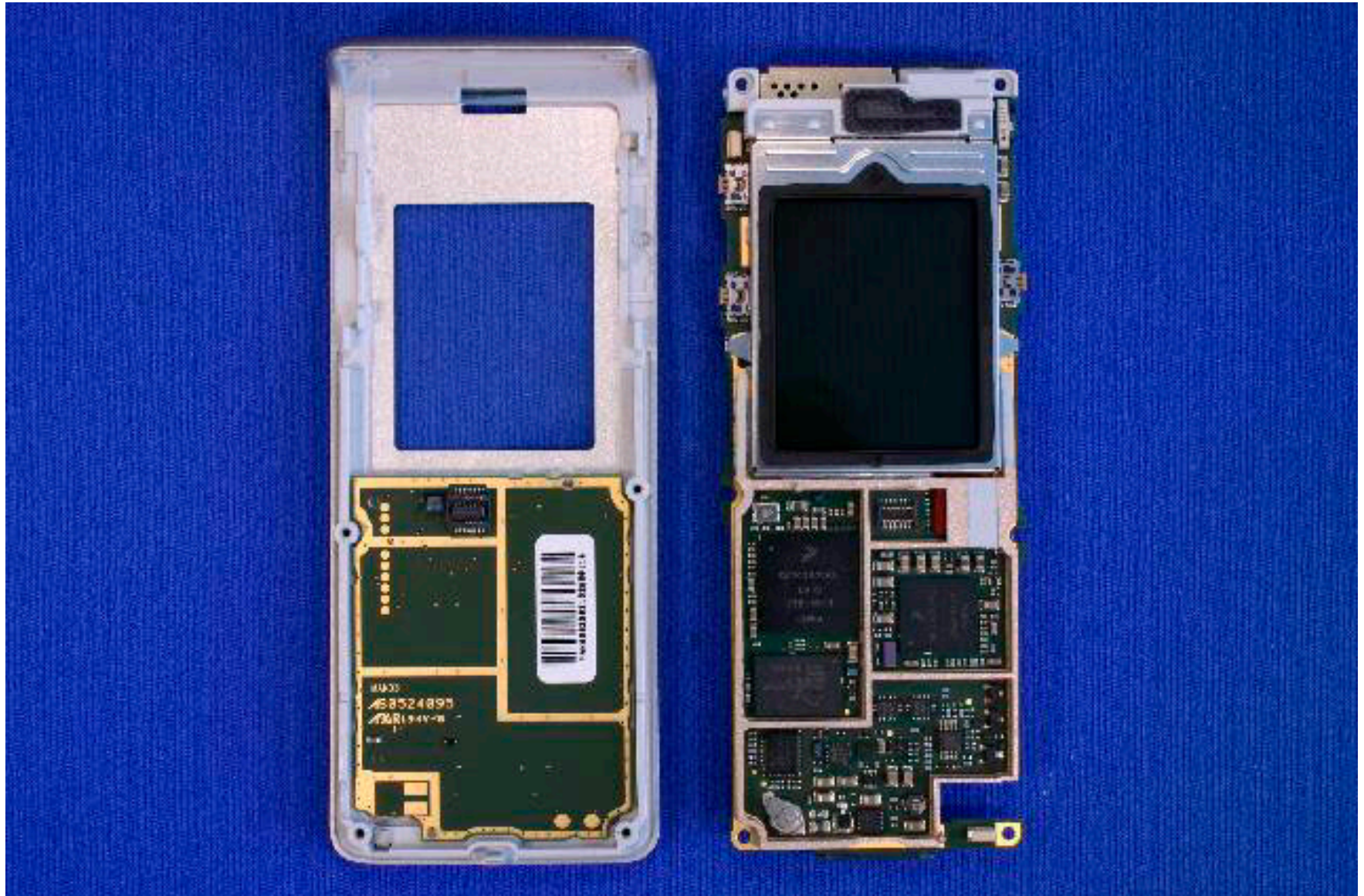
CC75 Disassembly Step 3