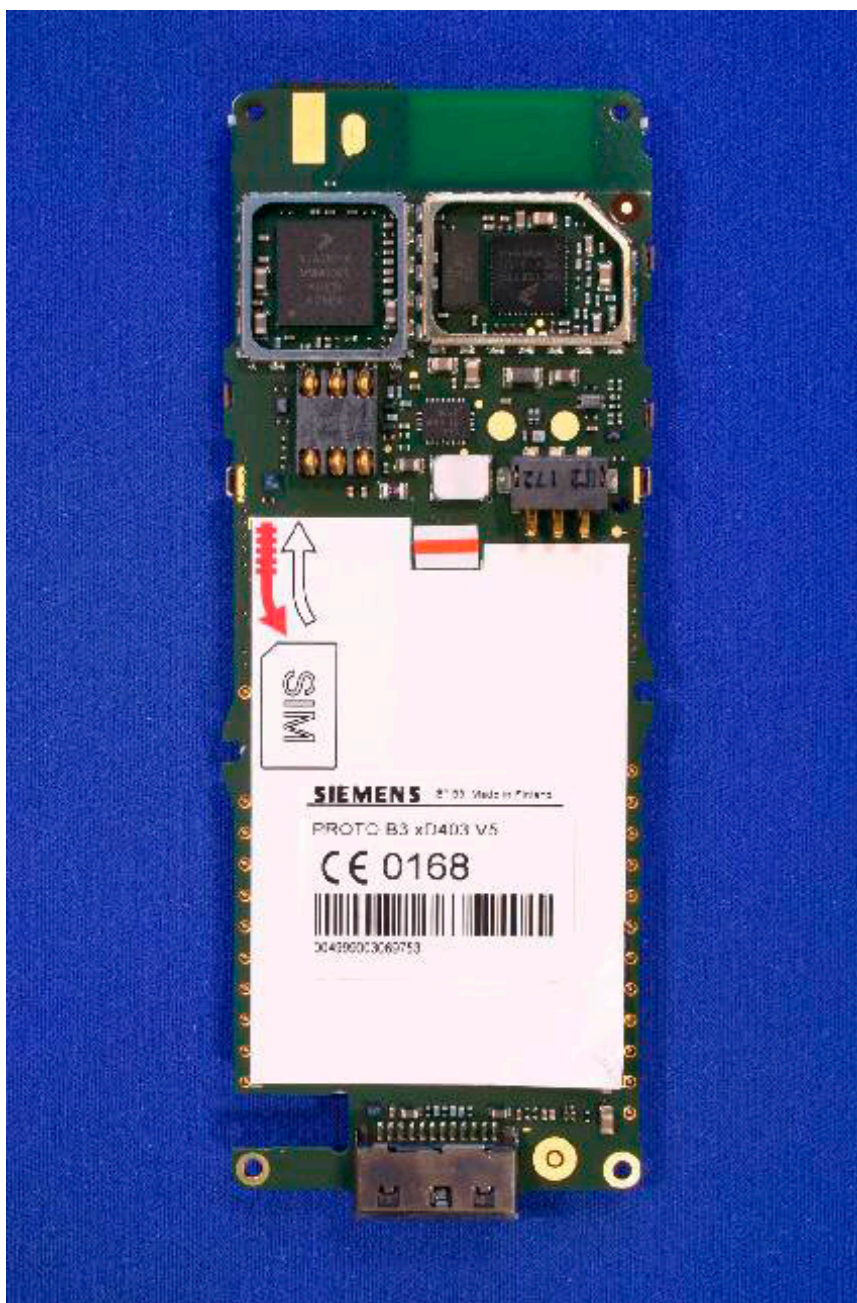
CC75 PCB Back View Shield removed