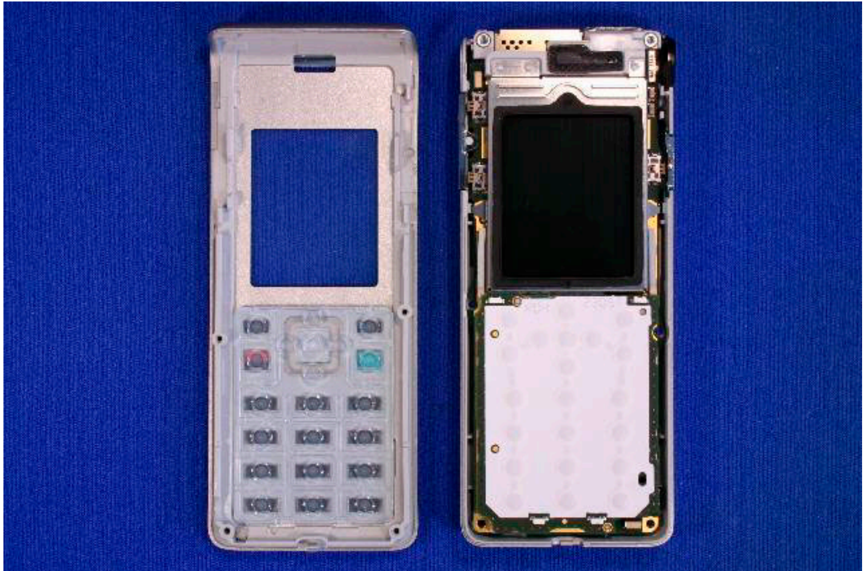
CC75 Disassembly Step 2