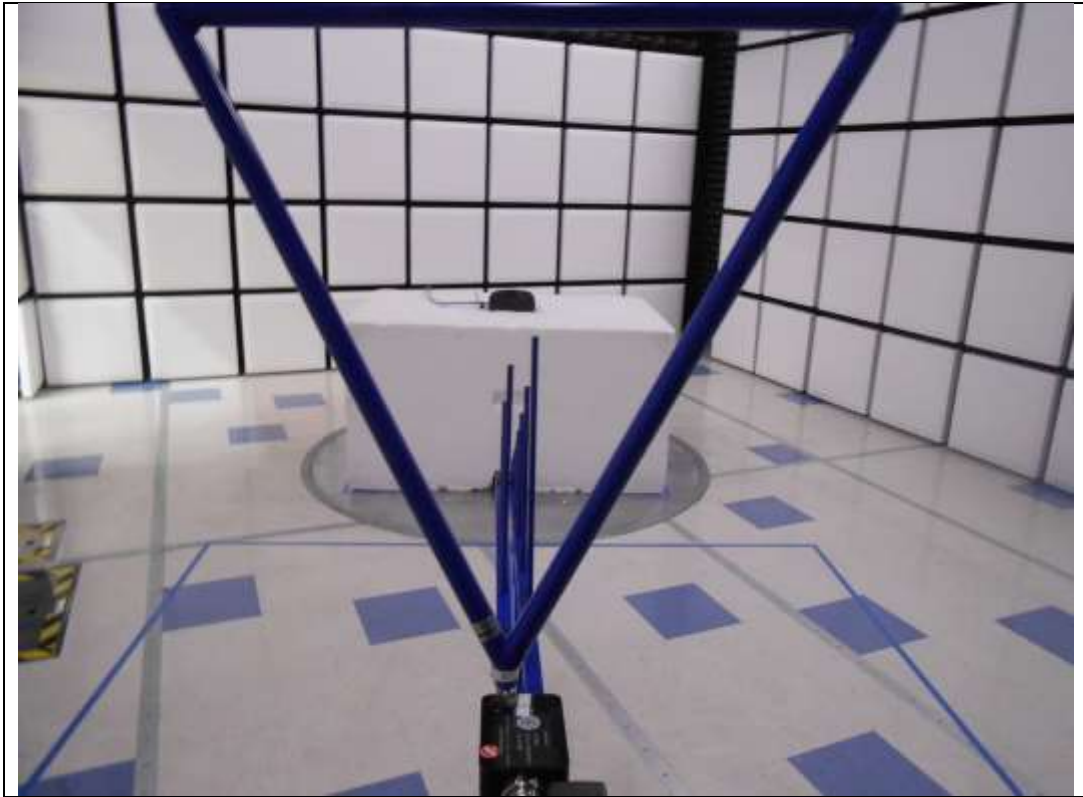
RF Radiated (Greater than 1GHz)