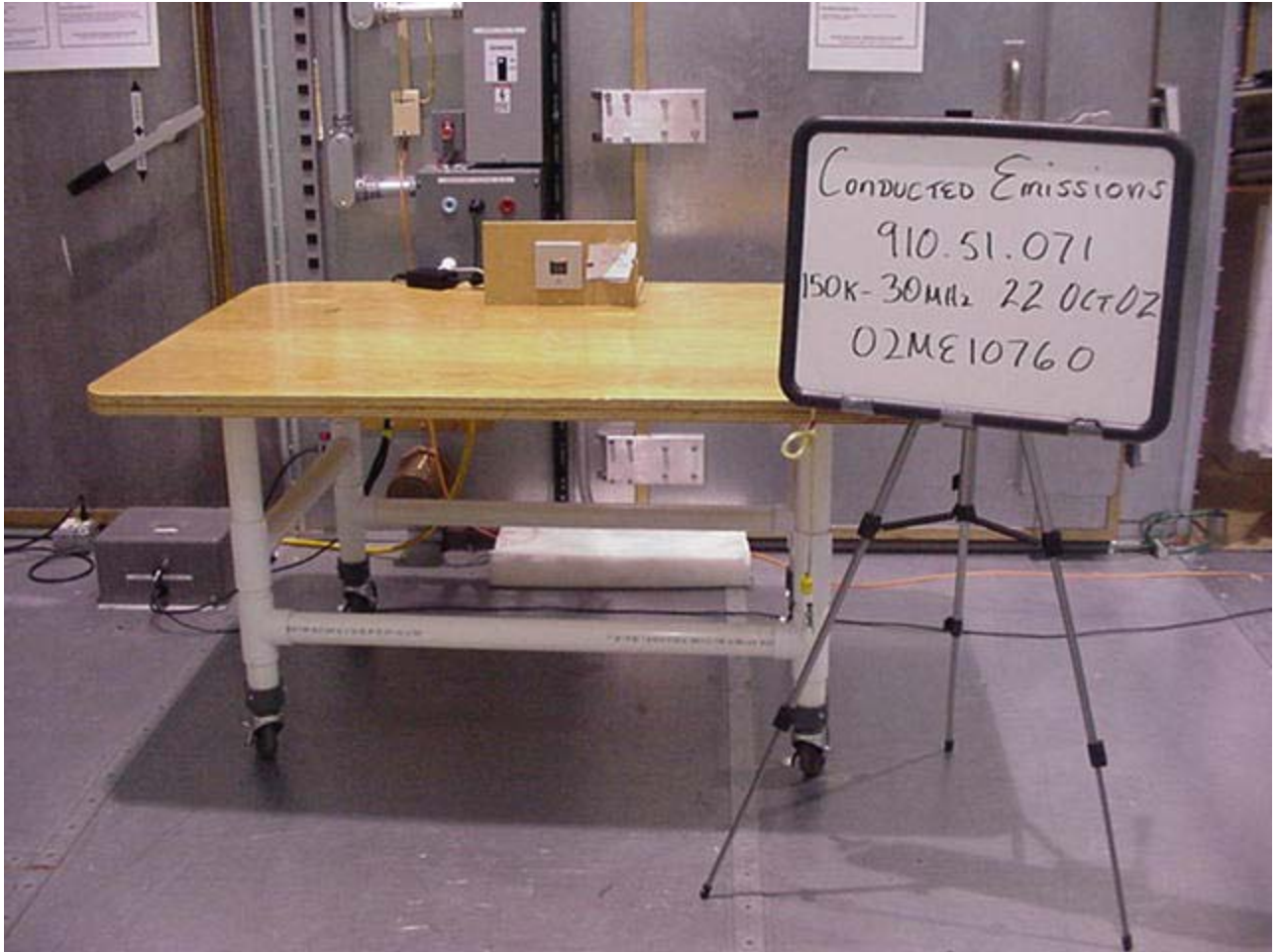
Conducted Emissions Test .150 – 30 MHz