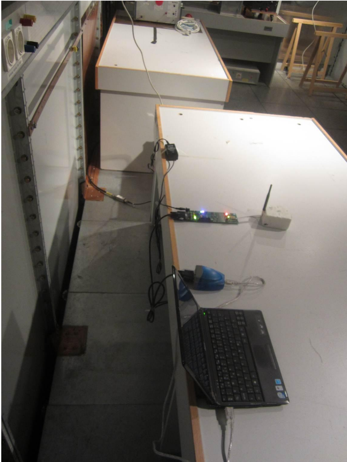
136117_04: Test setup – conducted emissions on power supply lines