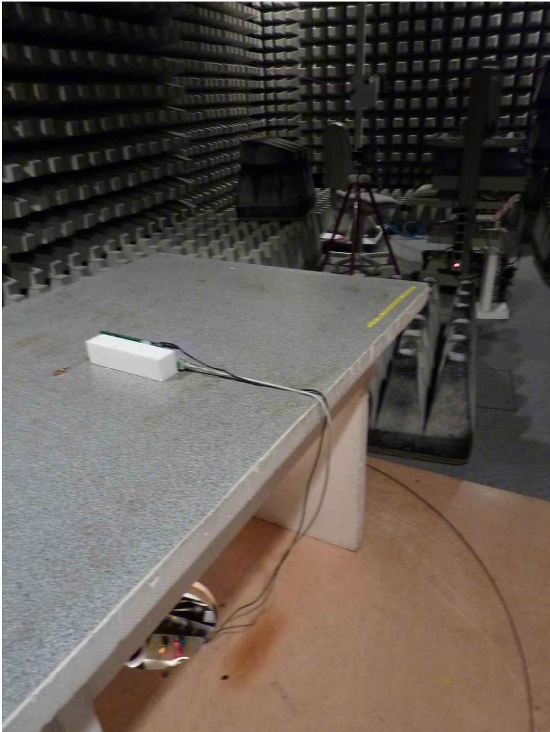
136117_03: Test setup - Radiated emission, Antennas terminated (fully anechoic chamber)