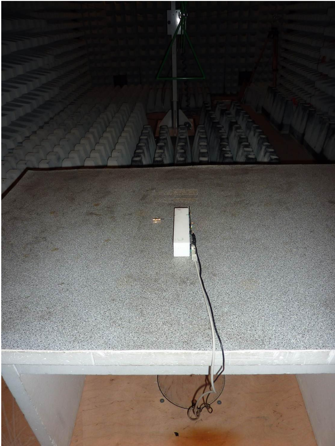
136117_01: Test setup - Radiated emission, Antennas terminated (fully anechoic chamber)