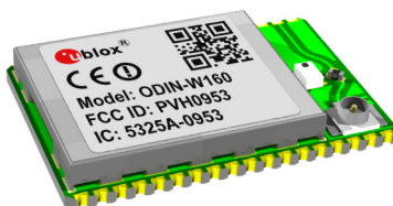
Figure 1 3D-view of ODIN-W160 FCC/IC identifier label

The FCC/IC identifier marking is a label affixed on the shield box.