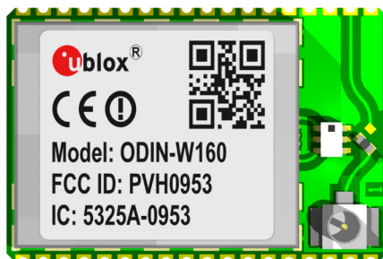
Figure 2 ODIN-W160 FCC/IC identifier printed on a label affixed on the shield box