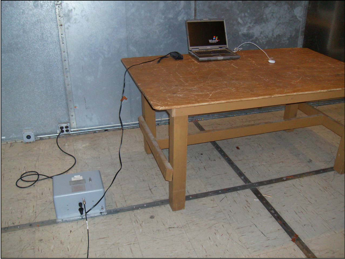
Photograph 1. Test Setup