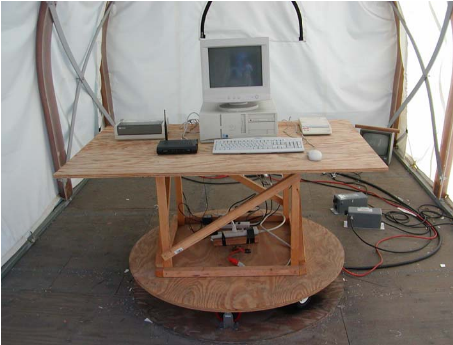
Radiated Emission - Rear View