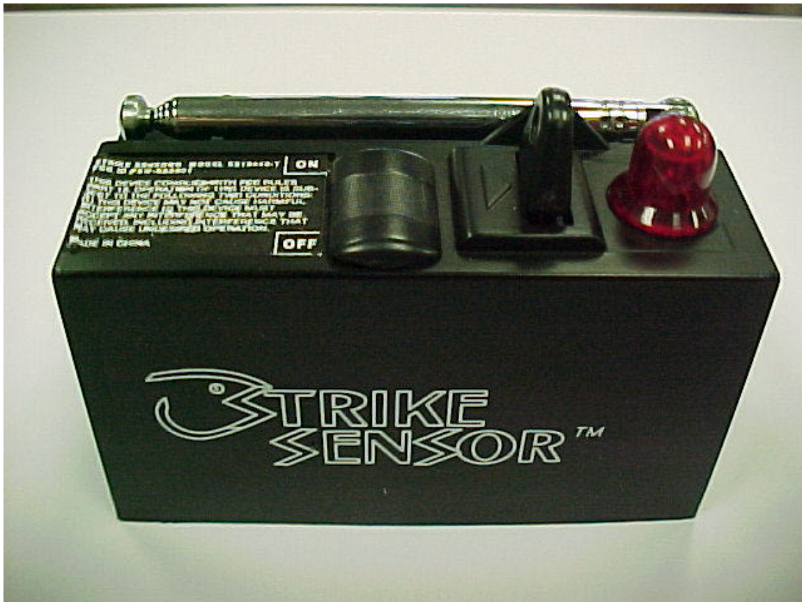
Photo One Front Cover of Strike Sensor