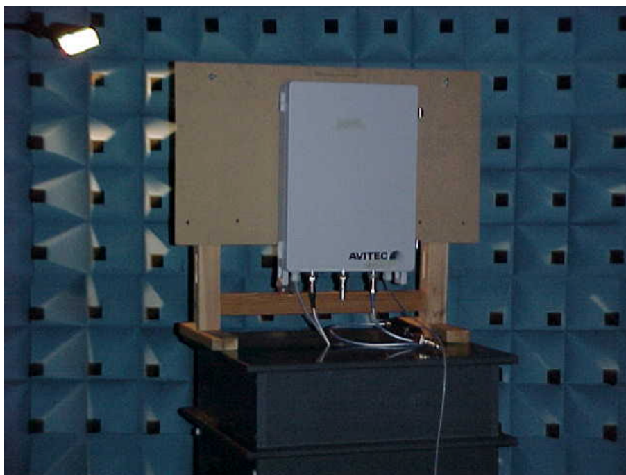
Radiated spurious emission 1 – 26 GHz