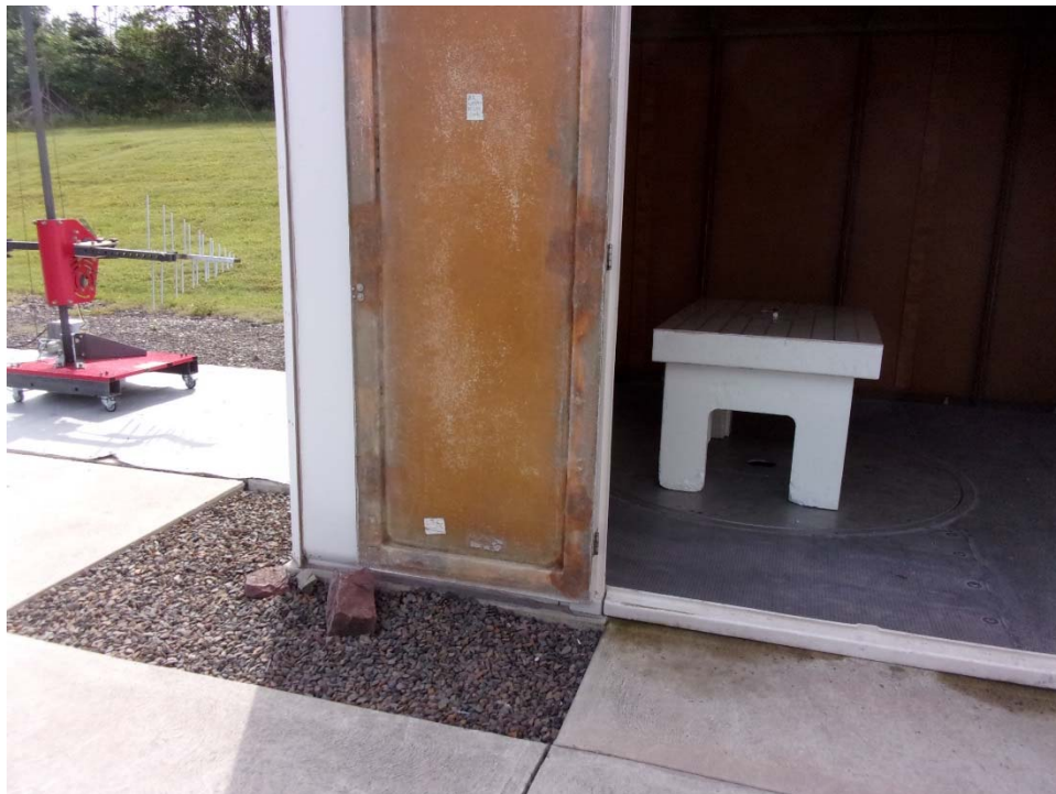
Vertical Antenna Polarization, Below 1 GHz