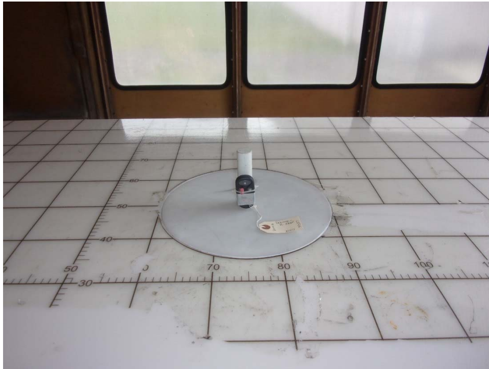
Test Setup, X Axis, Below 1 GHz