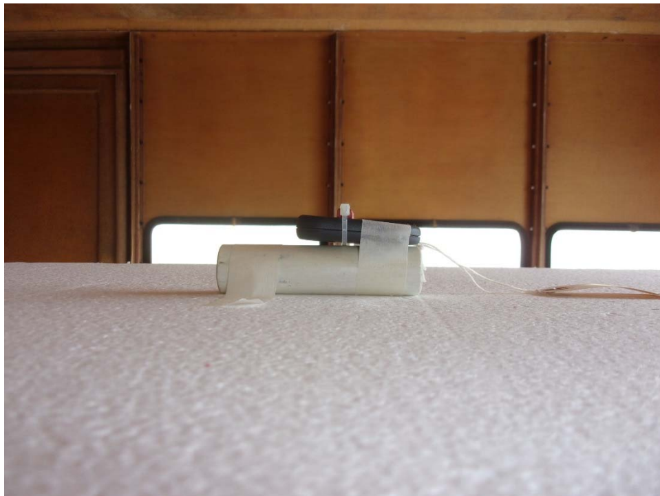
Test Setup, Z Axis, Above 1 GHz