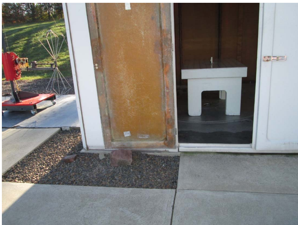
Vertical Antenna Polarization, 30 MHz to 200 MHz