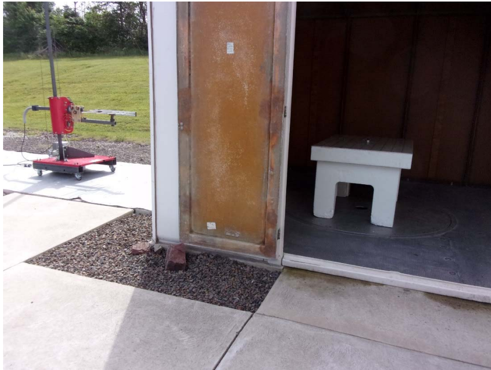
Horizontal Antenna Polarization, Below 1 GHz