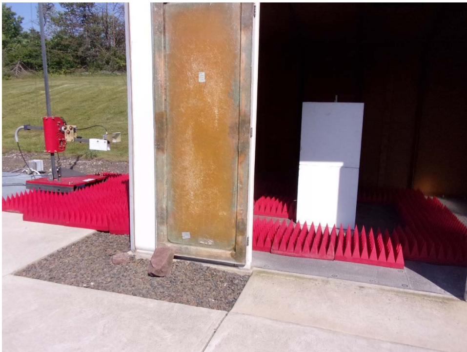
Vertical Antenna Polarization, Above 1 GHz