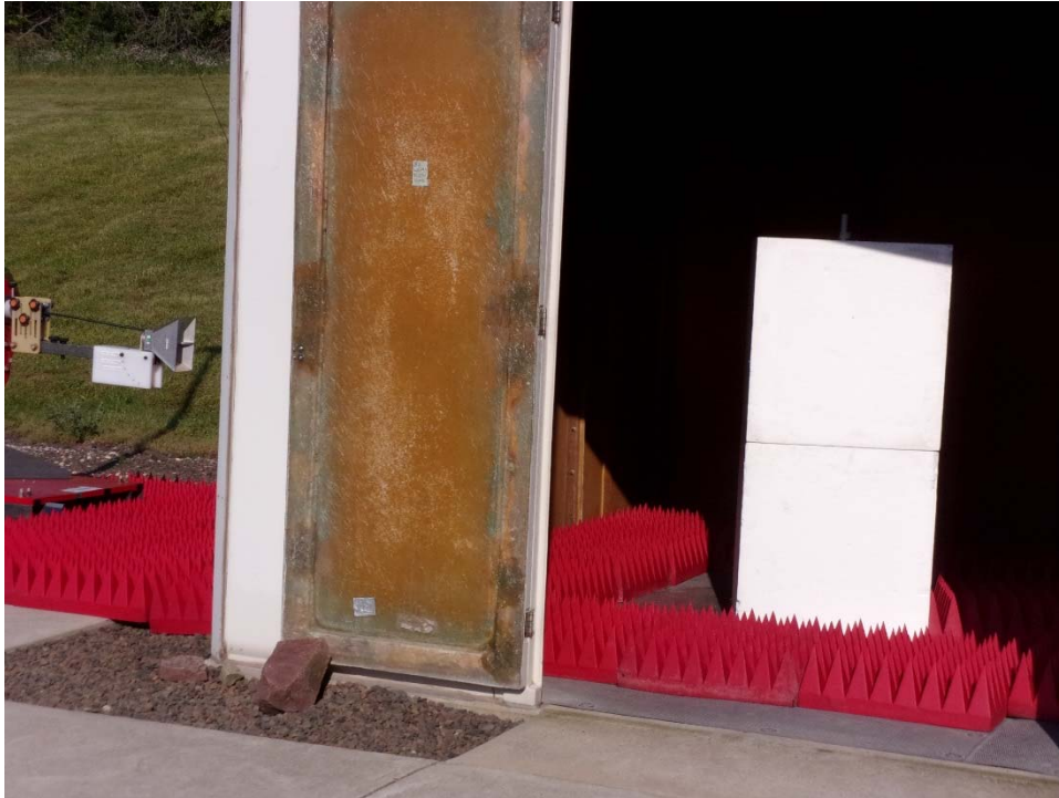
Horizontal Antenna Polarization, Above 1 GHz