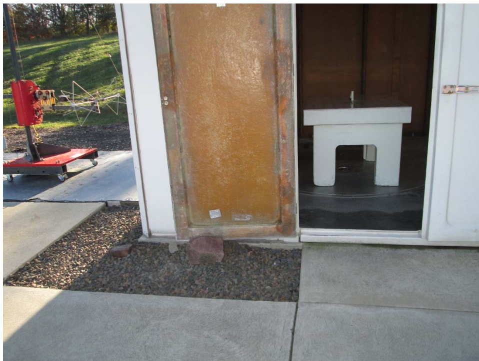
Horizontal Antenna Polarization, 30 MHz to 200 MHz