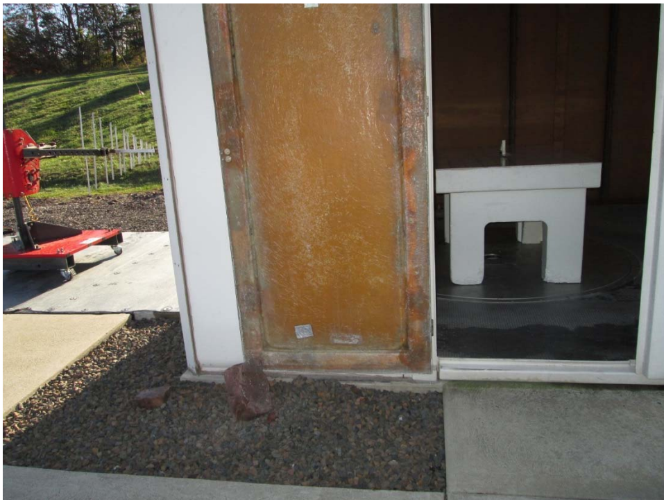
Vertical Antenna Polarization, 200 MHz 1 GHz