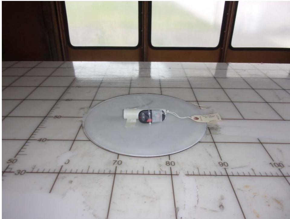
Test Setup, Y Axis, Below 1 GHz