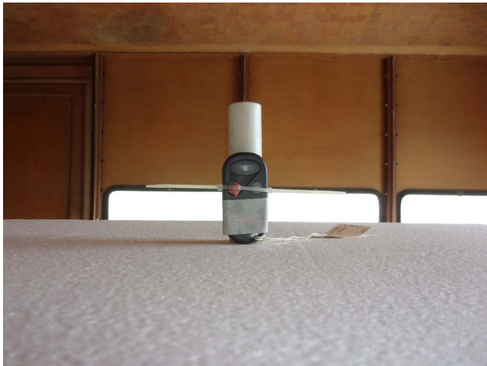
Test Setup, X Axis, Above 1 GHz