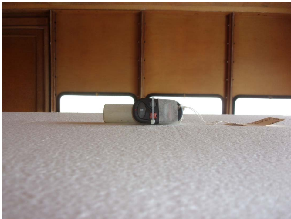
Test Setup, Y Axis, Above 1 GHz