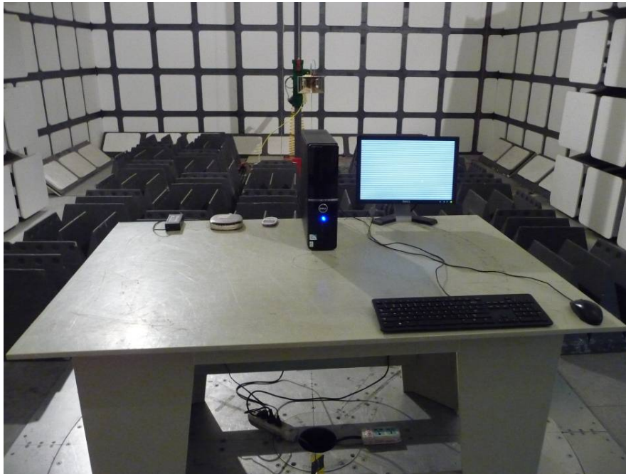
Radiated Emissions – Rear View (Above 1 GHz)