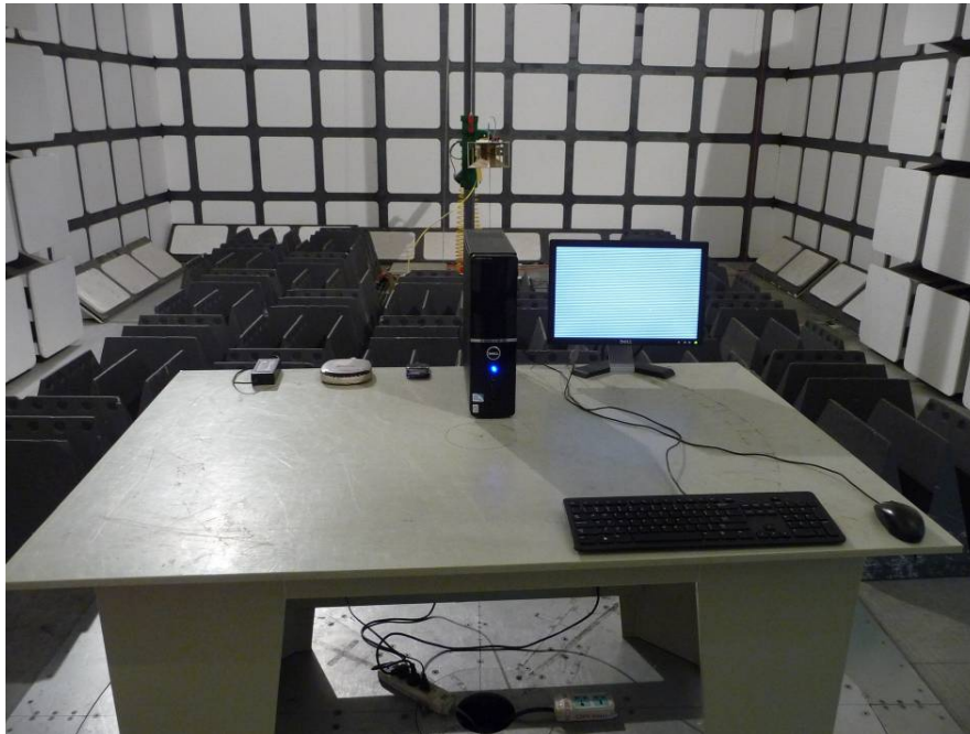
Radiated Emissions – Rear View (Above 1 GHz)