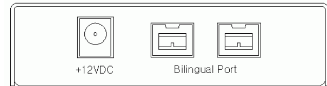
Figure 3 – Side View of M4-200 Repeater