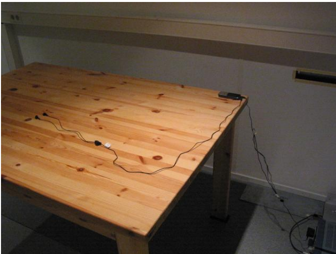
Picture 3. FCC Part 15C AC powerline conducted emissions