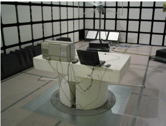
Picture 2. FCC Part 15B Radiated emissions