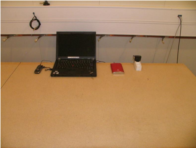
Measured from the AC plug of the Phone.