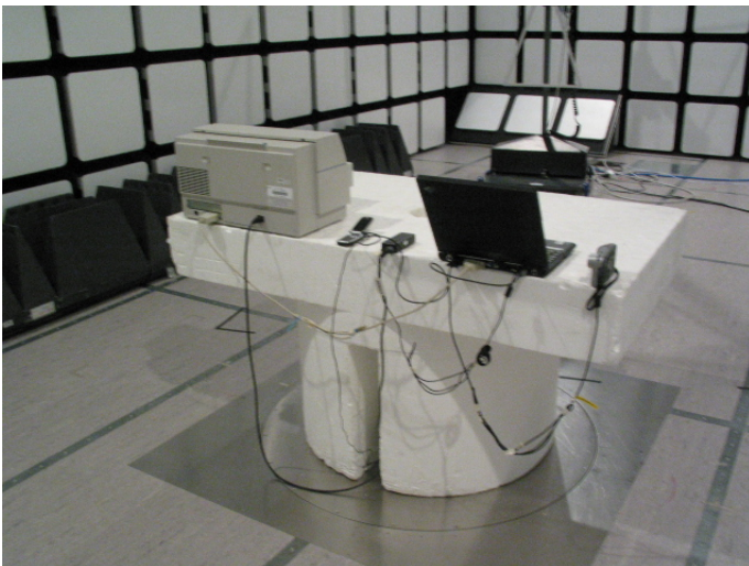
Picture 2 Radiated emission measurement GSM RX / Bluetooth TX + Computer peripherals