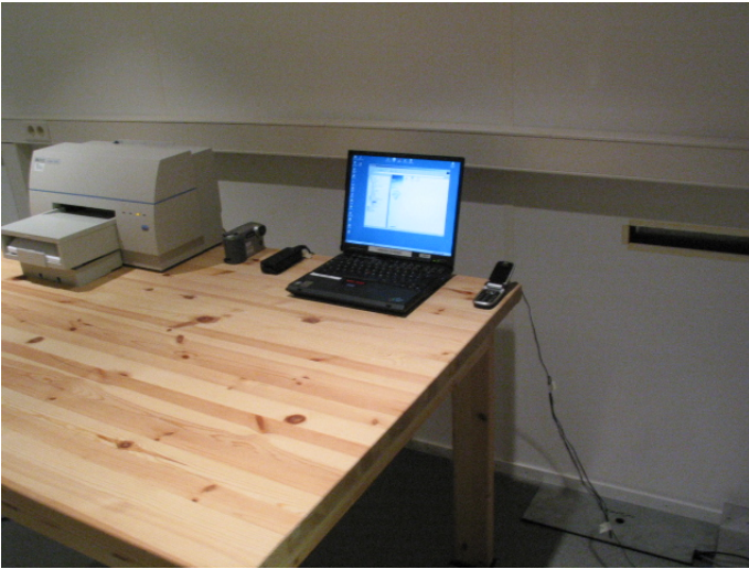
Picture 3 AC powerline conducted emission measurement GSM RX / Bluetooth TX + Computer peripherals