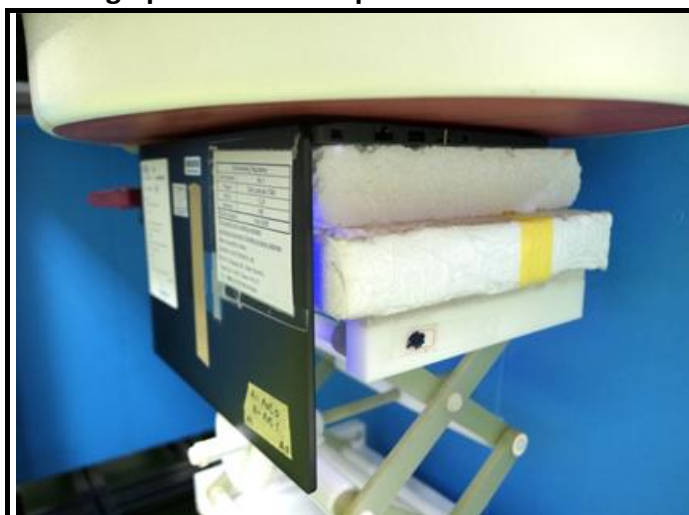
Body - Bottom of EUT at 0 mm