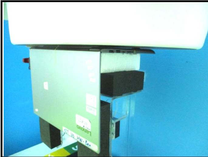
Bottom of EUT with 0 mm Gap