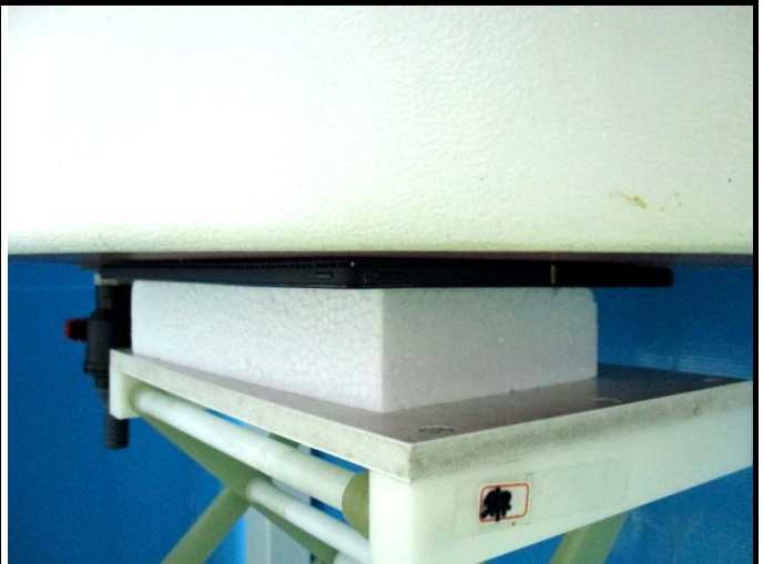
Rear Face of EUT with 0 cm Gap (w/ battery 2)