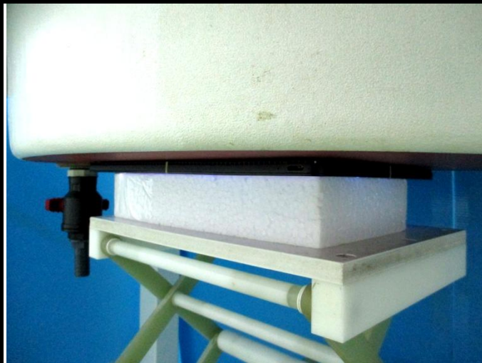
Rear Face of EUT with 0 cm Gap (w/ battery 1)