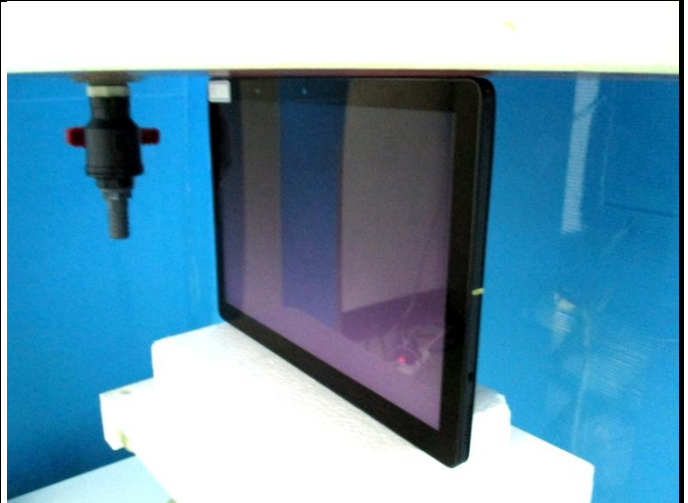
Top Side of EUT with 0 cm Gap (w/ battery 2)