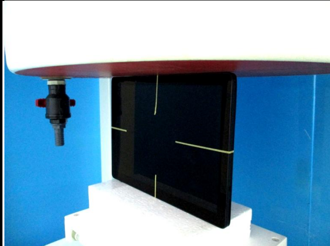
Top Side of EUT with 0 cm Gap (w/ battery 1)