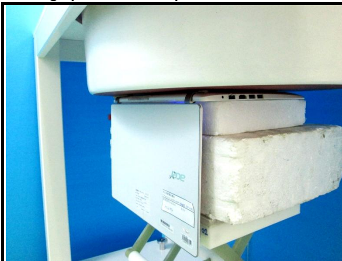
Bottom of EUT with 0 cm Gap