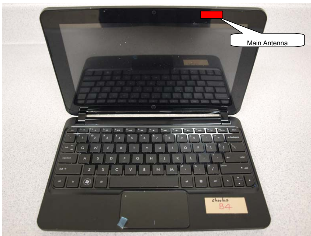
HP HSTNN- Q46C Tablet