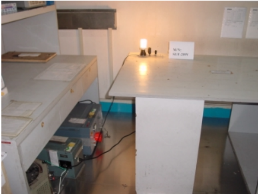
FRONT VIEW OF CONDUCTED EMISSION TEST