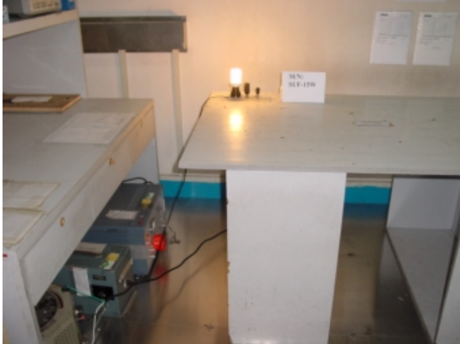
FRONT VIEW OF CONDUCTED EMISSION TEST