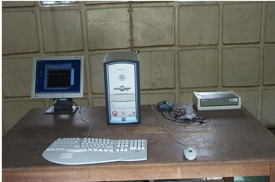
Photograph 2: Setup for Radiated Emissions