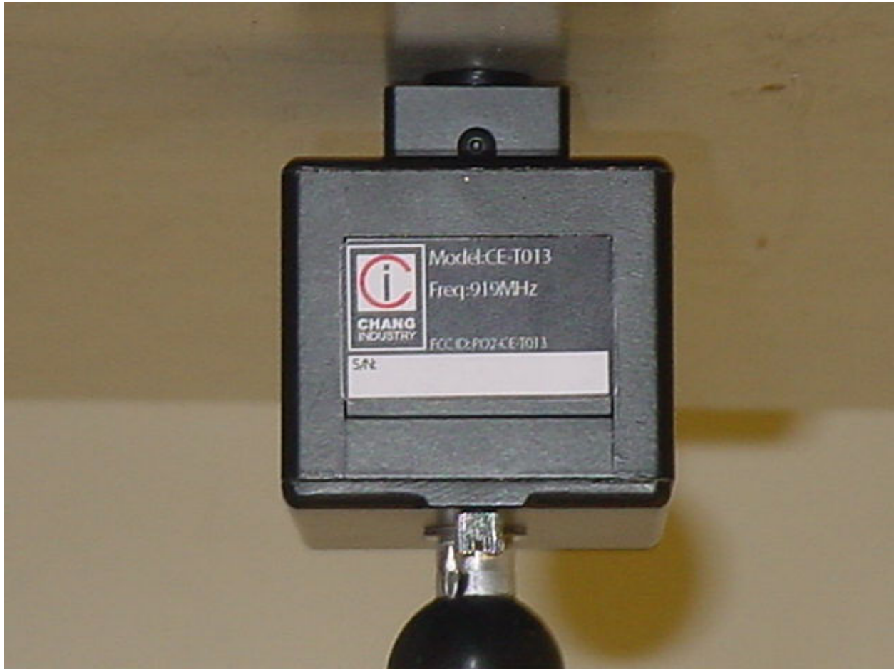
Bottom View, Label Location.