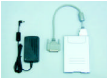
Figure 1-9 Accessories

It is also important to understand the accessories that come along with your Mini-Book PC and how they help make you work efficiently. This section describes briefly what these accessories can do for you and what other options you have.