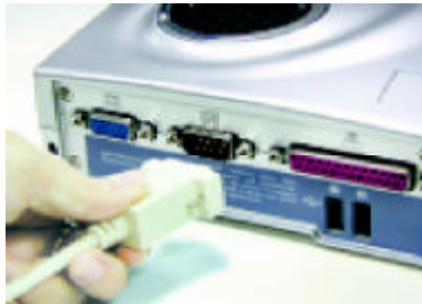
Figure 4-1 Connecting a Serial Device

Your computer has one 9-pin male serial port for connecting an external serial mouse or modem. The serial (RS232) port of your computer is normally referred to as COM1. You would normally use the serial port to connect a serial modem for Internet dial-up connection. However, your computer may come with a built-in internal modem so you do not need to install one.