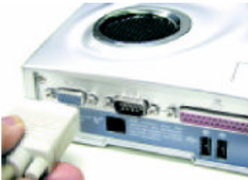
Figure2-4 Connecting an External Monitor