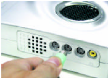
Figure 2-2 Connecting an External Keyboard

⇒ Do not disconnect or connect the external keyboard when power is on. Turn off the computer first.