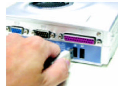
Figure 4-4 Connecting USB Devices