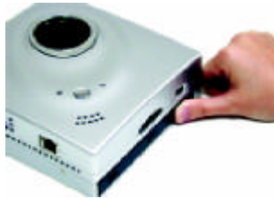
Figure 3-4d Closing the CD-ROM Drive Tray