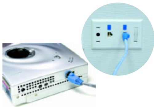
Figure 3-6 Connecting to the LAN