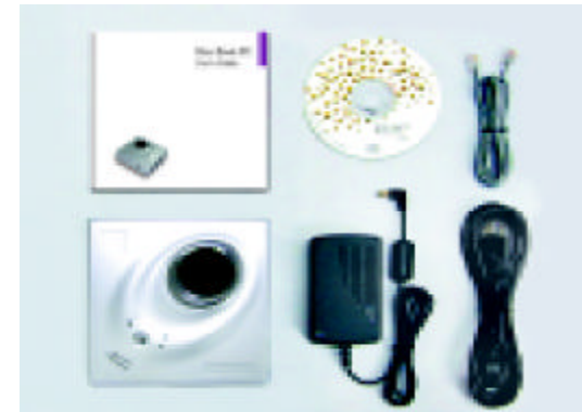
Figure 0-1 Standard Out-of-the-Box Computer Items

C ongratulations for having purchased your new Mini-Book PC. You will start doing a lot of great and fun things with your computer. Along with your computer comes several items which you need to check inside the box. See photo below and compare: