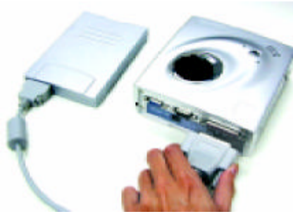
Figure 3-2 Connecting the External FDD via the Parallel Port