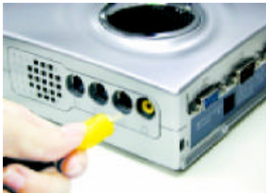
Figure 4-3 Connecting to Your TV