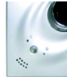
Figure 2-6 Power Button

Press the power button to start your computer and check if the CPU fan turns on.