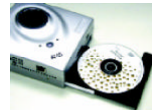
Figure 3-4c Removing the Compact Disc Inside