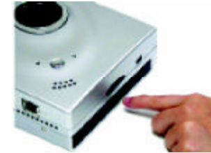
Figure 3-4a Releasing the CD-ROM Drive Tray