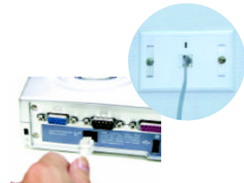
Figure 3-5 Connecting to the Modem