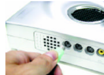
Figure 2-3 Connecting an External Mouse

⇒ Do not disconnect or connect the external mouse when power is on. Turn off the computer first.