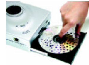
Figure 3-4b Placing the Compact Disc Inside