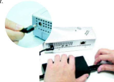
Figure 2-5 Connecting the AC Adapter

⇒ Do not remove the AC adapter when the computer is on as this will abruptly shut off the computer and may damage your computer parts.