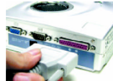
Figure 4-2 Connecting a Printer

⇒ You can switch between printer and external FDD without shut down your computer.