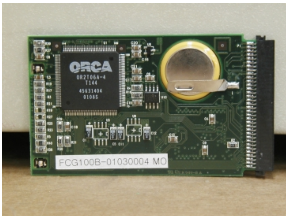
Main PCB Rear View