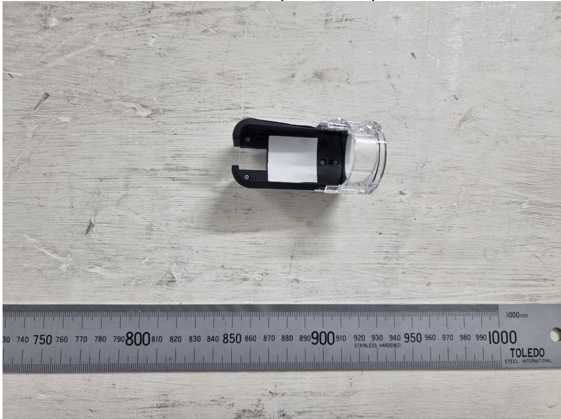
EUT External (Radiated Unit)