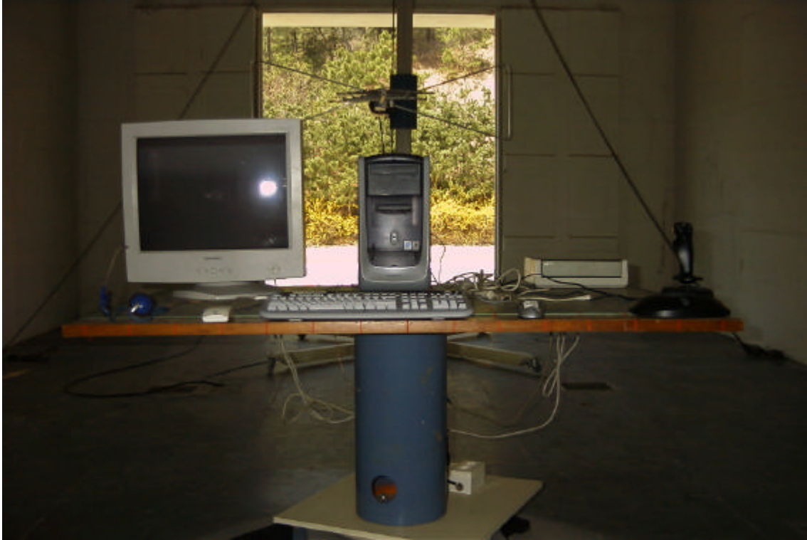
Radiated Emission 30MHz ~ 1000MHz