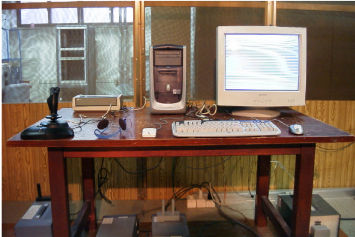
Conducted Emission 450kHz ~ 30MHz