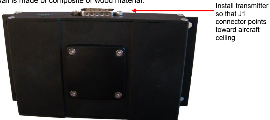
Figure 1 Digital wireless headphone transmitter

The wall-mounted transmitter must be mounted with the J1 connector pointing toward the ceiling of the aircraft cabin. It can be placed behind a bulkhead or other wall, as long as the bulkhead or wall is made of composite or wood material.