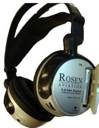
Figure 3 Open battery compartment

Note: Never leave batteries inside the headphones for long periods of time to prevent damage to the headphones from leaking batteries.