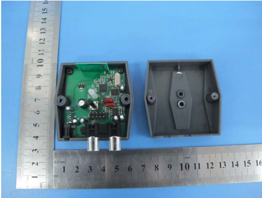
Photo 6 Appearance of PCB