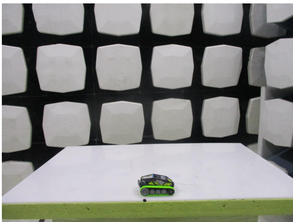
Up to 1GHz (EUT was placed in the centre of the turntable)