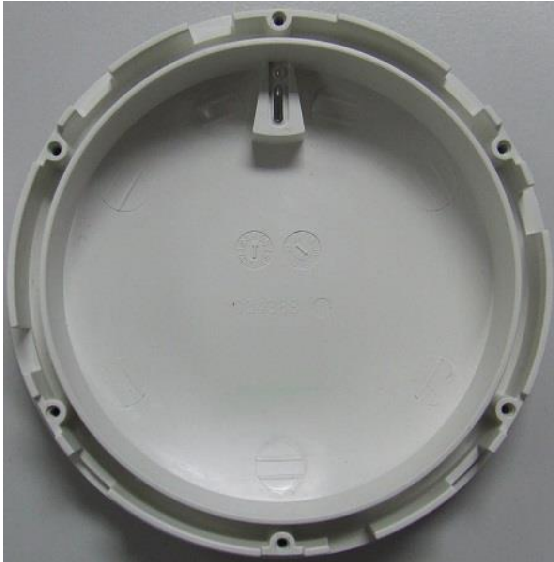
Front Cover inside