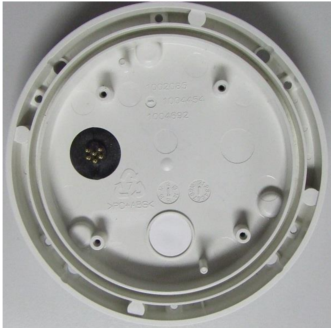
Rear Casting (Inside)