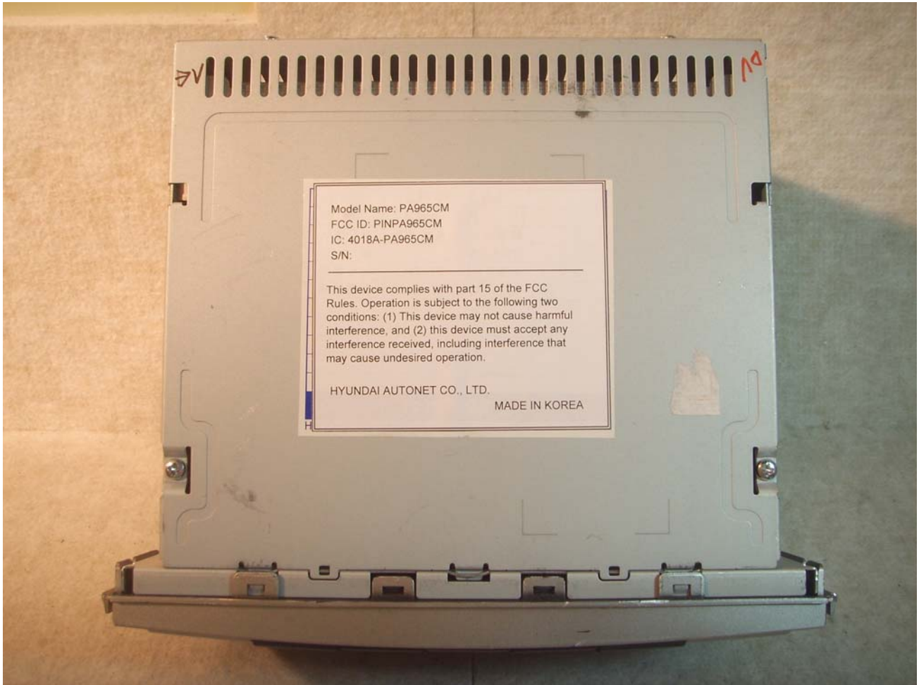
Figure 1.2 LABEL LOCATION

The label shown shall be permanently affixed at a conspicuous location on the device and be readily visible to the user at the time purchase. (Labeling requirements per 2.925)