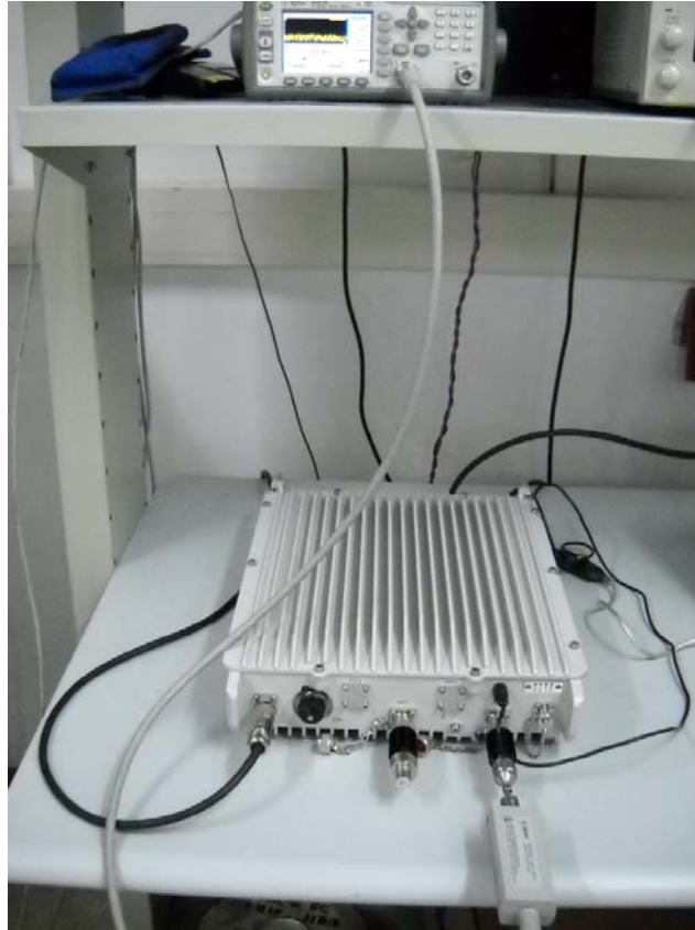
Photograph No.1 Peak output power setup