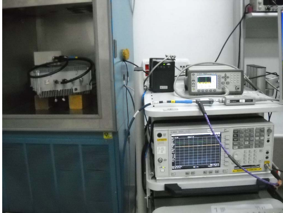
Photograph No.1 Peak output power, occupied bandwidth, emission mask and conducted spurious emissions measurement setup