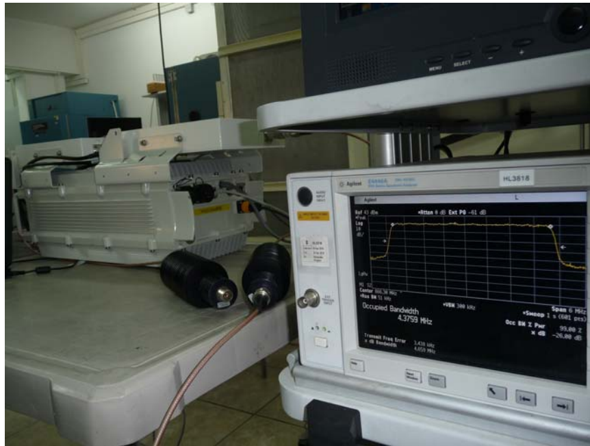
Photograph No.1 Peak output power, occupied bandwidth measurement setup