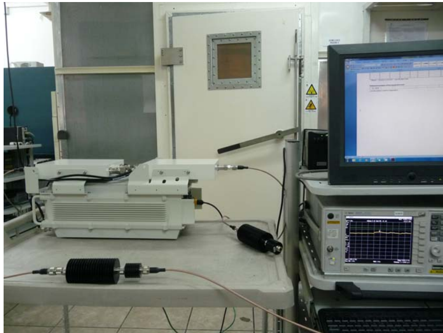
Photograph No.3 Spurious emissions measurement setup in the anechoic chamber below 30 MHz