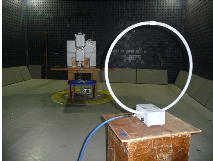
Photograph No.4 Spurious emissions measurement setup in the anechoic chamber below 30 MHz