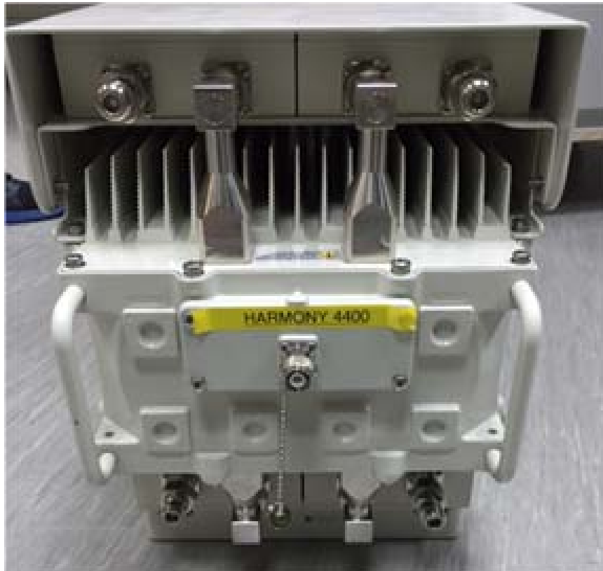
Photograph No.1 “AirHarmony 4400 2.5 GHz (B41)” base station top panel view with antenna connectors