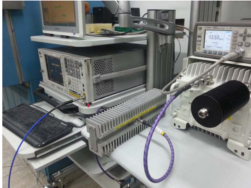
Photograph No.1 Peak output power measurement setup