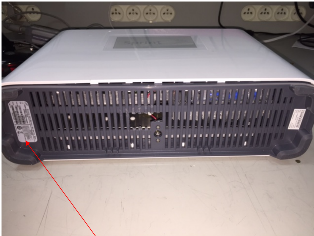
“AirUnity 545 eNB 2.5 GHz (B41)” bottom panel, label with FCC ID:PIDAU545ENB25 location