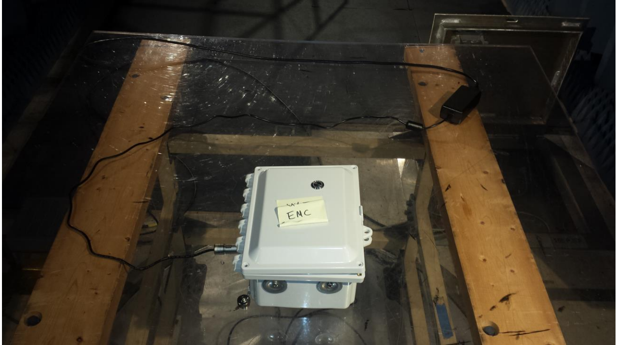
Placement of 12V power supply and UUT over ground plane.