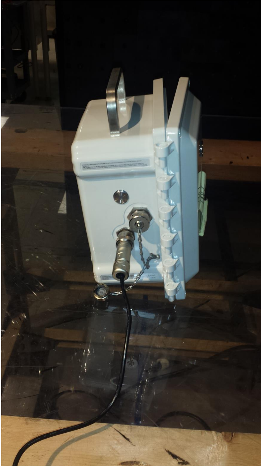
Connection of power supply to UUT.