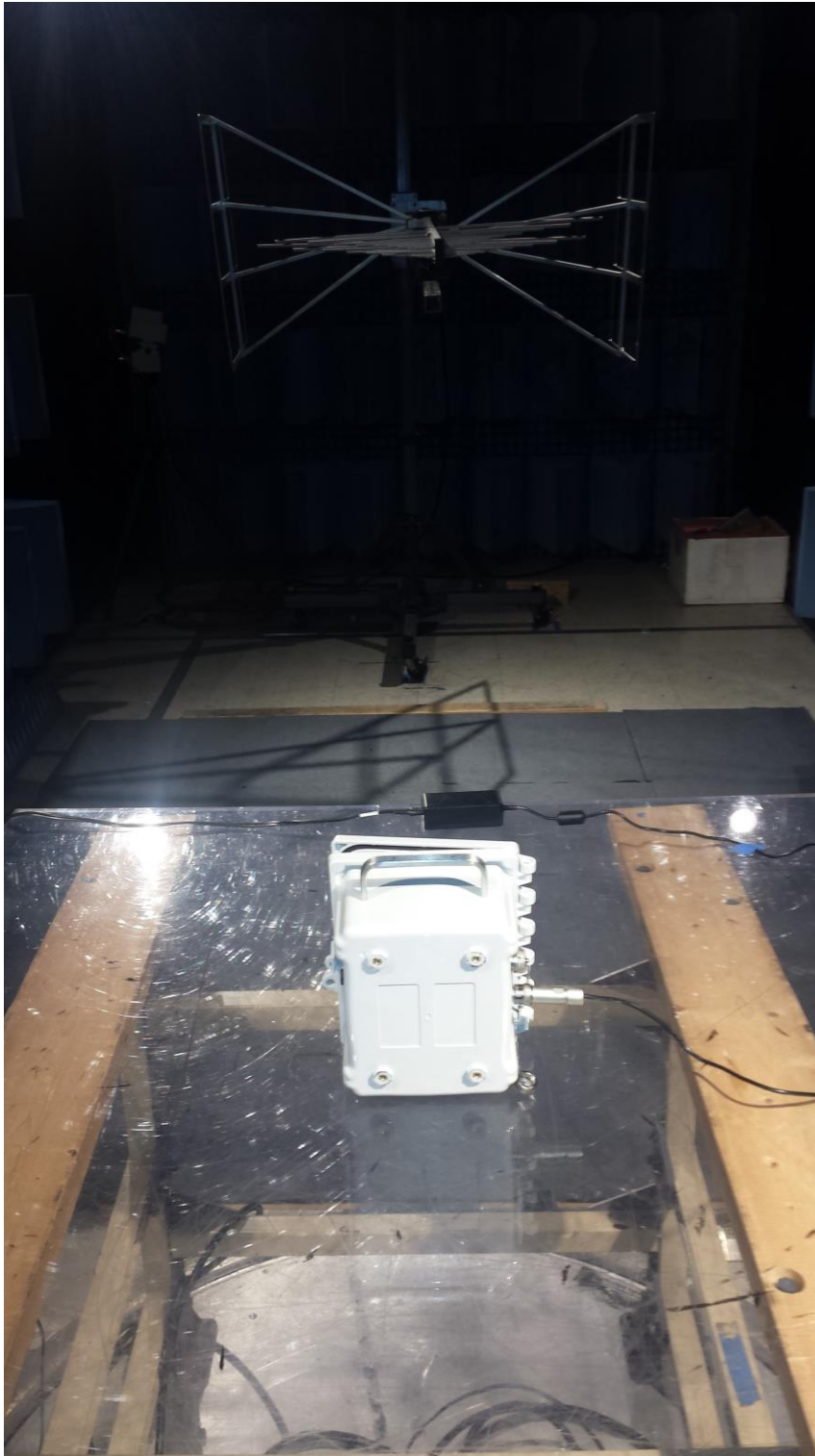
Placement of UUT and power supply in relation to antenna.