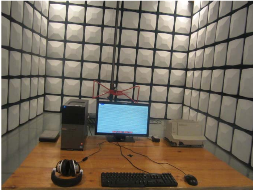
Radiated Emission – (Rear View, Below 1 GHz)