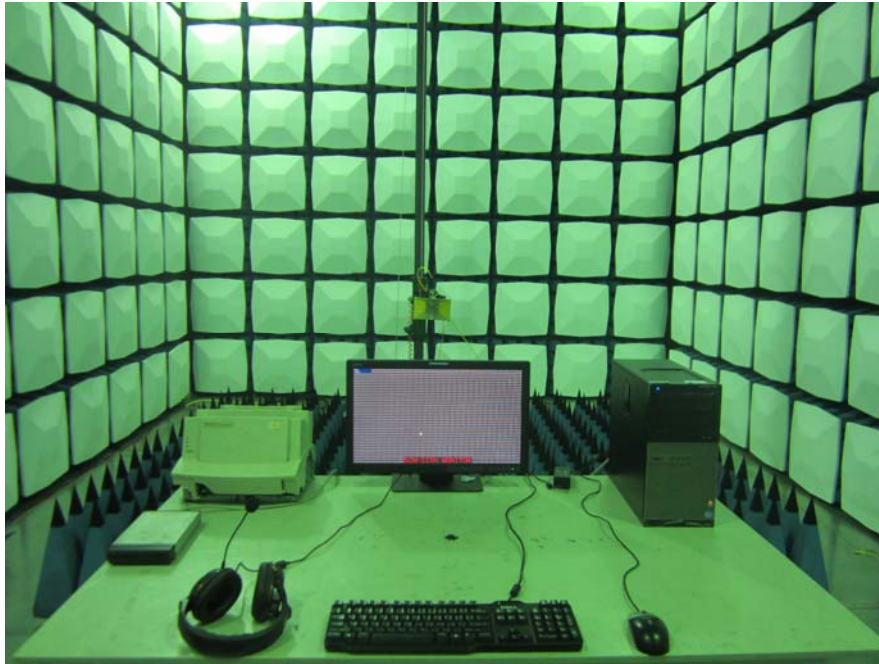
Radiated Emission – (Rear View,Above 1 GHz)