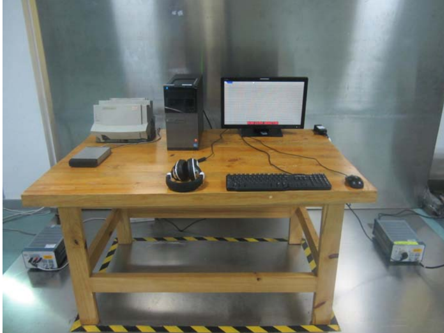
Conducted Emission - Side View