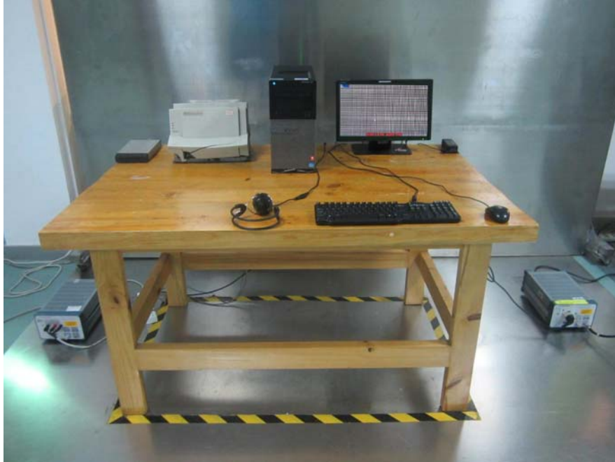
Conducted Emission - Side View