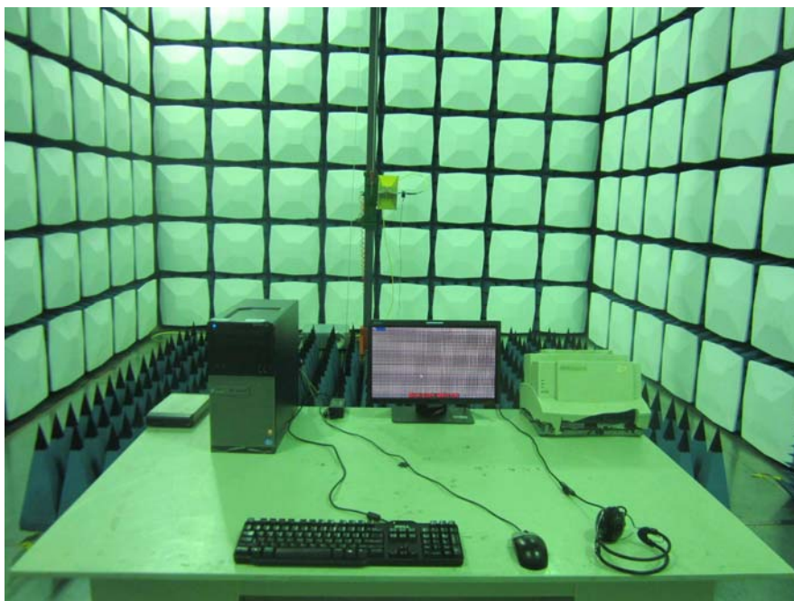
Radiated Emission – (Rear View,Above 1 GHz)