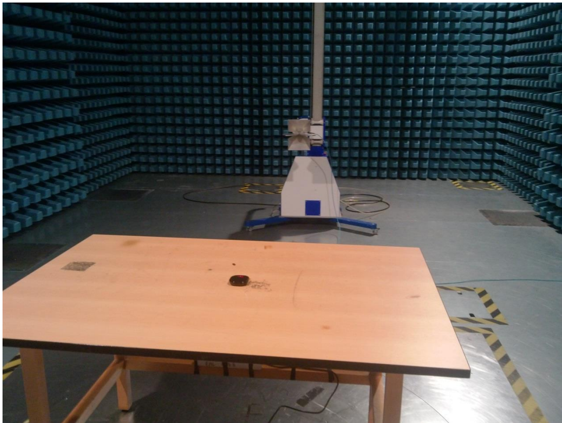
Above 1 GHz