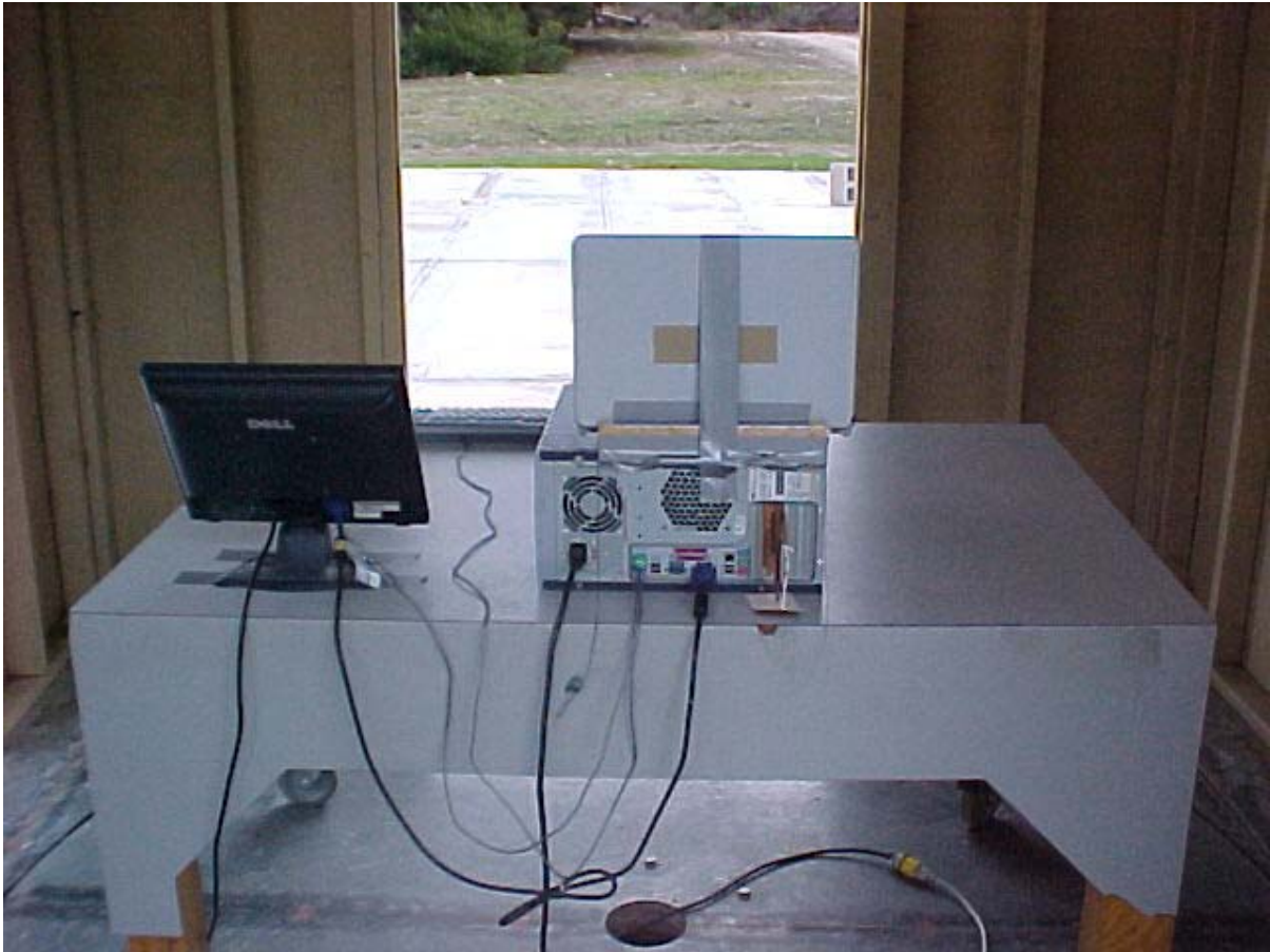
Radiated Emissions Measurement (Rear View) Foxconn (Sony I306) Antenna Setup