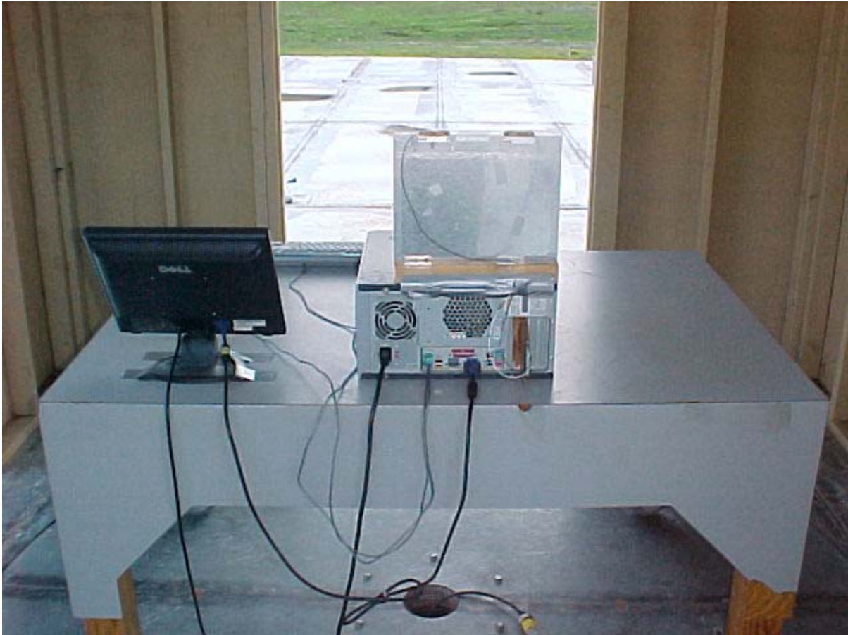
Radiated Emissions Measurement (Rear View) Amphenol (Samsung Neon) Antenna Setup