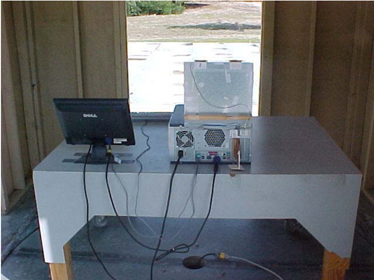
Radiated Emissions Measurement (Rear View) Hitachi (Samsung Neon) Antenna Setup