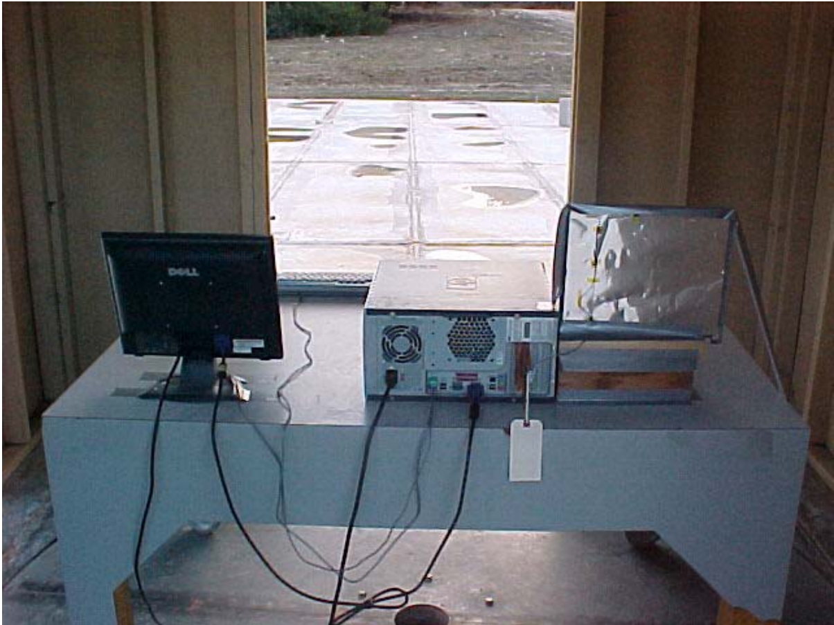
Radiated Emissions Measurement (Rear View) Wistron Neweb Corporation (Acer TravelMate 4050) Antenna Setup