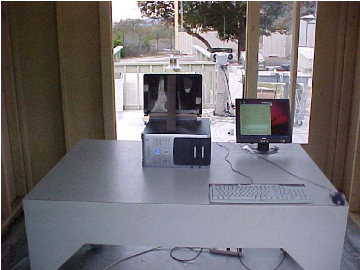
Radiated Emissions Measurement (Front View) Foxconn (Sony I306) Antenna Setup