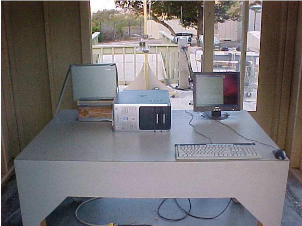
Radiated Emissions Measurement (Front View) Wistron Neweb Corporation (Acer TravelMate 4050) Antenna Setup