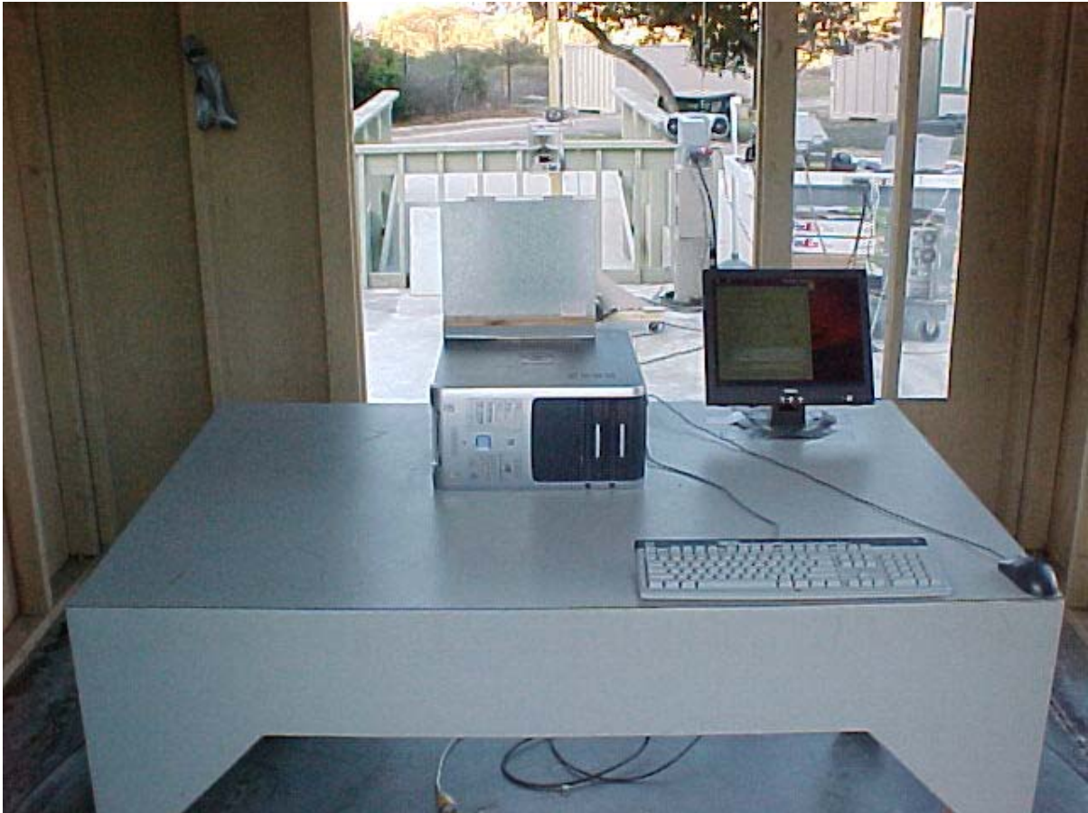
Radiated Emissions Measurement (Front View) Amphenol (Samsung Neon) Antenna Setup