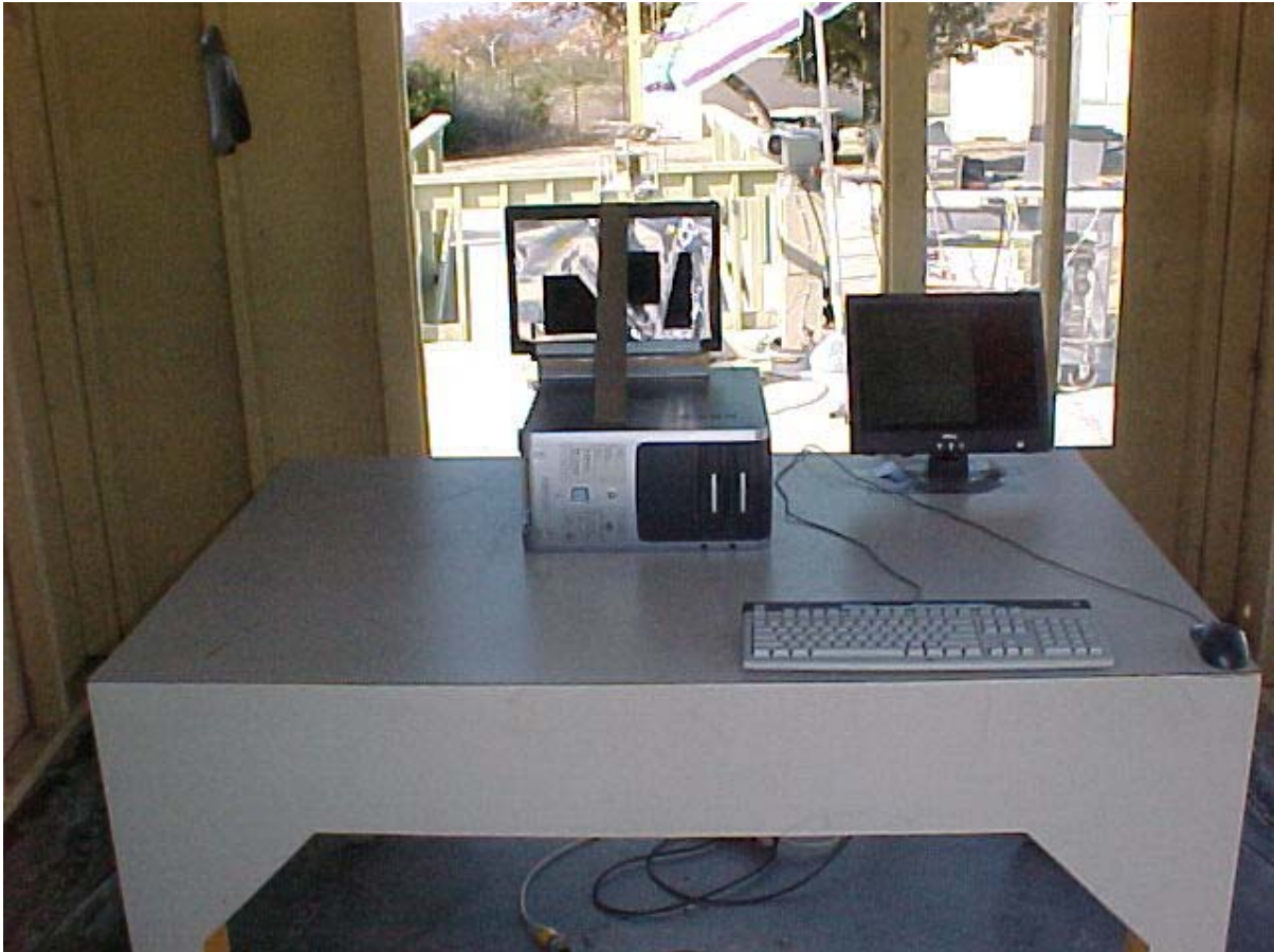
Radiated Emissions Measurement (Front View) Wistron Neweb Corporation (Acer Solution 2) Antenna Setup