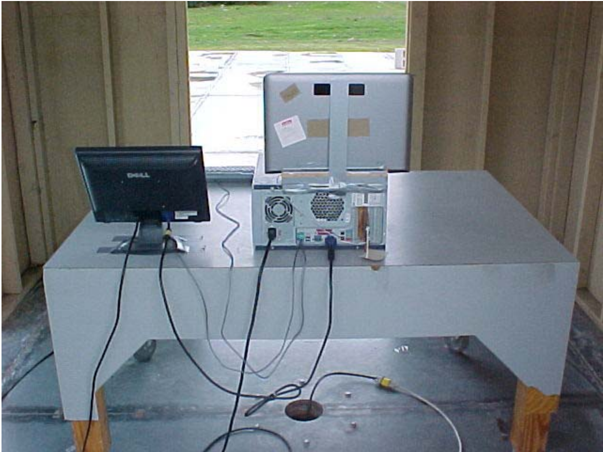
Radiated Emissions Measurement (Rear View) Phycomp/Yageo Corporation (Sony I275) Antenna Setup