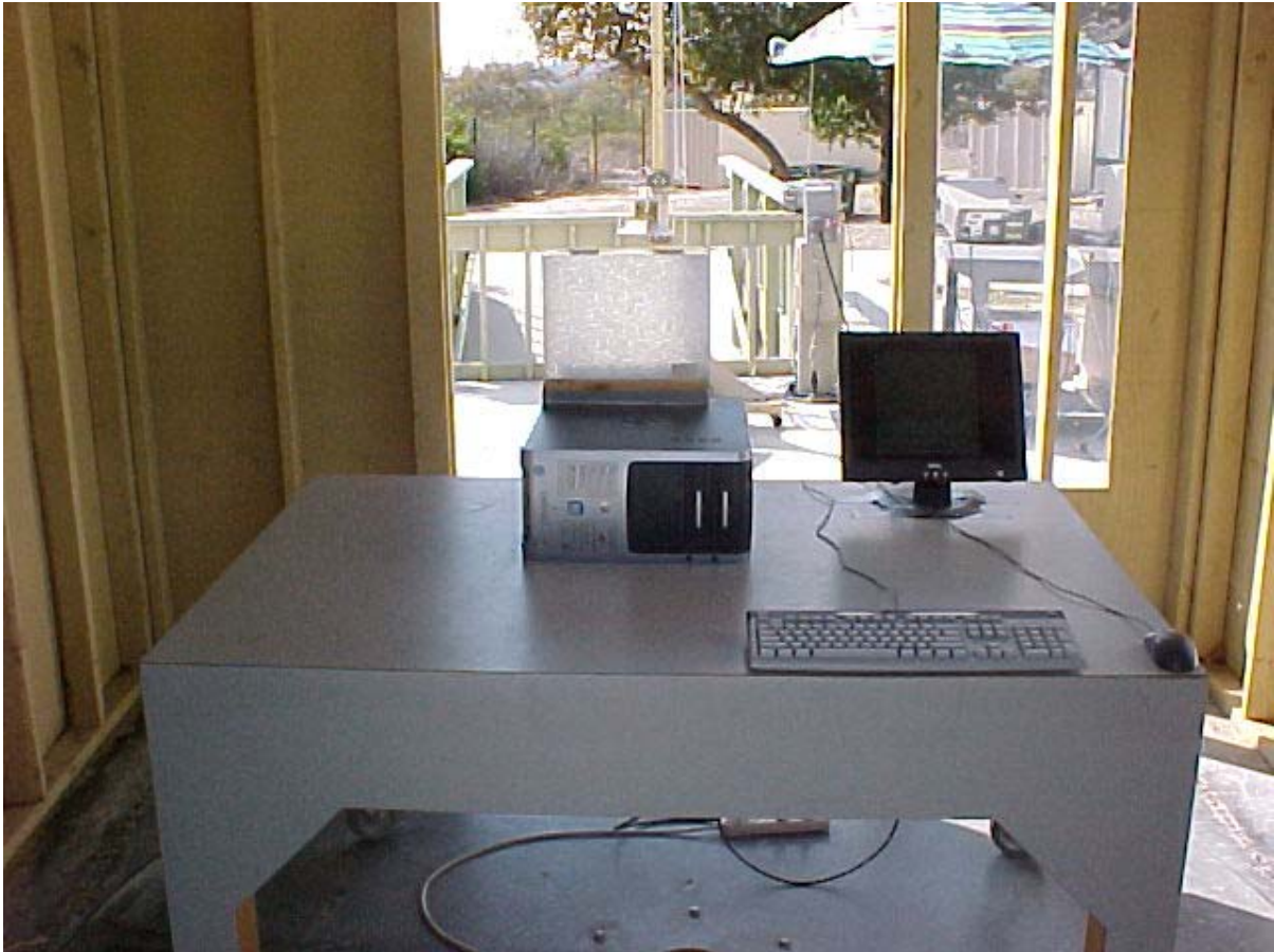
Radiated Emissions Measurement (Front View) Hitachi (Samsung Neon) Antenna Setup