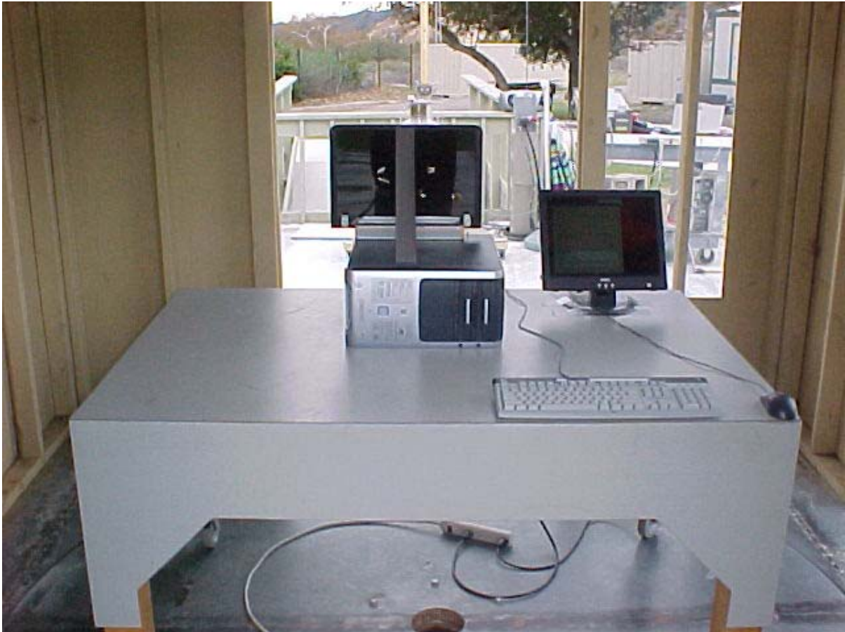
Radiated Emissions Measurement (Front View) Phycomp/Yageo Corporation (Sony I275) Antenna Setup