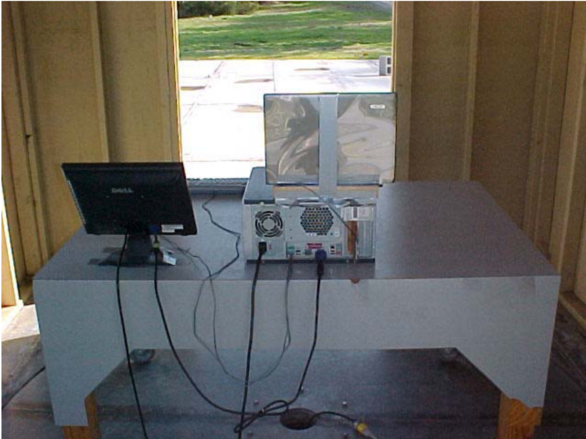
Radiated Emissions Measurement (Rear View) Wistron Neweb Corporation (Acer Solution 2) Antenna Setup